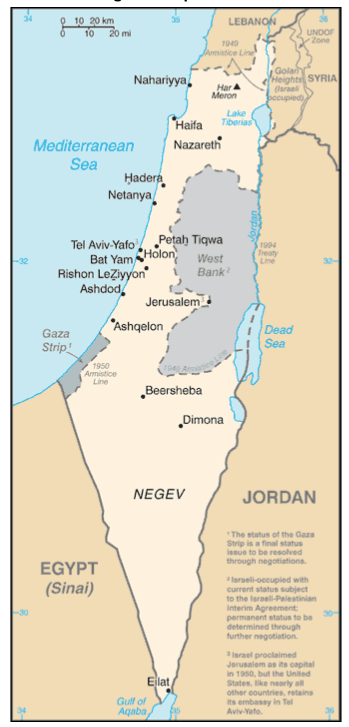
Figure 1. Map of Israel