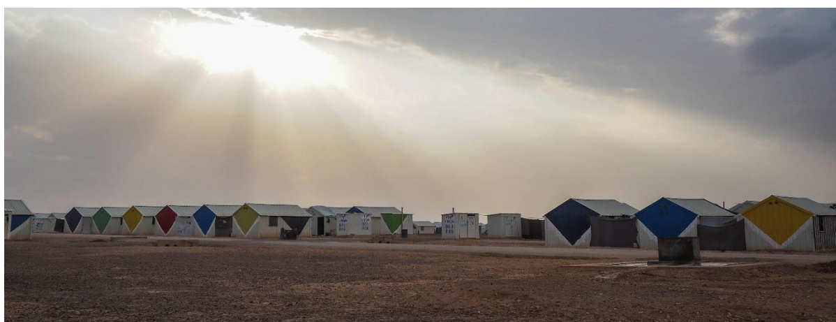
Dusk sets over Azraq refugee camp in Jordan's eastern desert.

Major donors of unrestricted and regional funds in 2016: United States of America (181 M) | Sweden (78 M) | Netherlands (46 M) | Norway (40 M) | Australia (31 M) | Priv Donors Spain (25 M) | Denmark (24 M) | Canada (16 M) | Switzerland (15 M) | France (14 M) | Germany (13 M) | Italy (10 M)