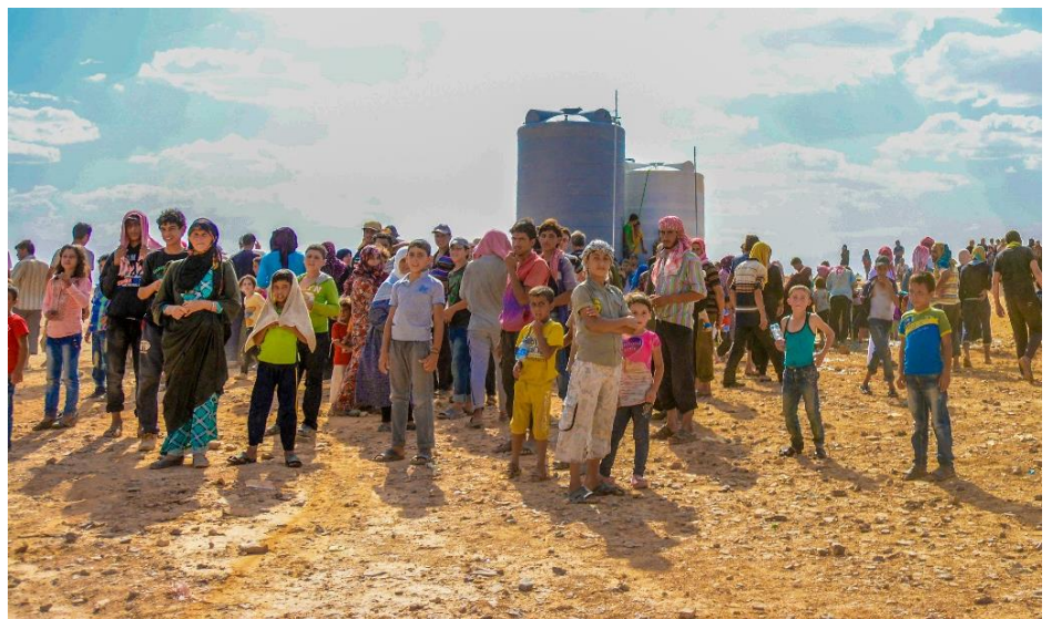
Syrians at Rukban gather around two water towers close to the Jordanian berm where many are surviving in desperate conditions.

*This operational update covers activities for the month of July.