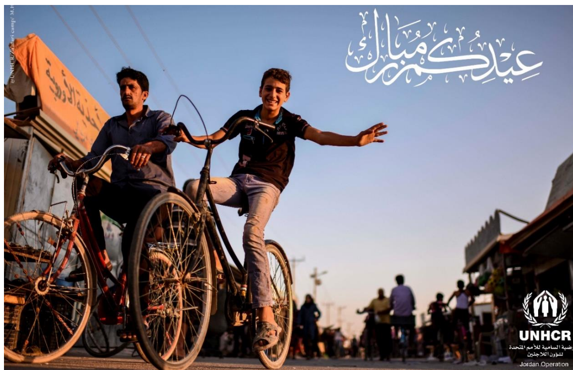
Eid Mubarak! Two Syrian refugees biking down the "Champs-Élysées" street in Zaatari camp.

In close cooperation with the Government, the World Food Programme (WFP), UNICEF, UNHCR and the International Organization for Migration (IOM) were able to proceed with a delivery of aid to both locations - Hadalat and Rukban - for the first time since 21 June between 2 - 4 August. The deliveries included 650 tonnes of food, including rice, lentils and dates, hygiene kits and jerry cans using cranes to deliver supplies to the Syrian side.