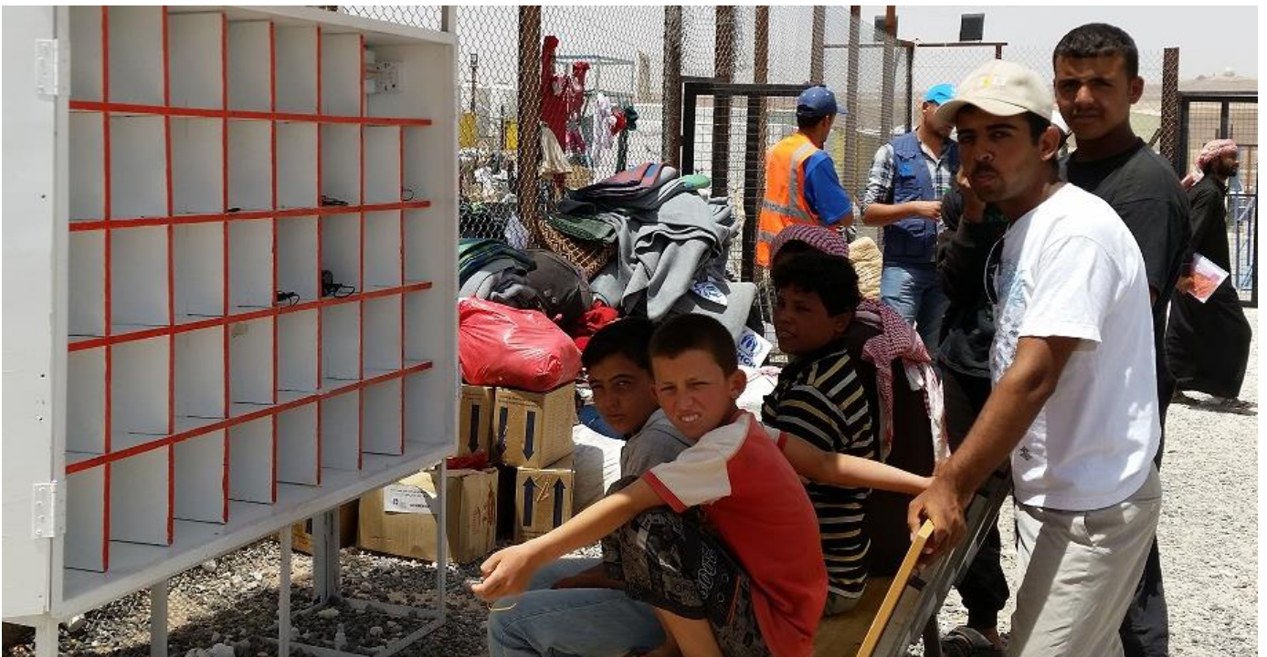
Syrian refugees making use of the new mobile charging stations at Azraq camp in May 2016, part of a series of initiatives undertaken through UNHCR's "Global Programme for Connectivity for Refugees".