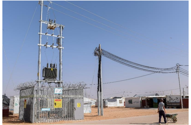
Before and after photos showing the progress made to the electrical network in Zaatari after the completion of the Czech Republic-funded project on 14 July.

A solar power plant, funded by the German development bank, KfW, is also being developed in Zaatari village which will provide a renewable source of electricity for the camp and the surrounding host community. The project is expected to become operational in 2017.