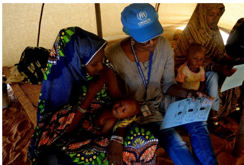
A UNHCR staff member assists a group of Fula women and their children in Mbera camp, Mauritania, after they fled inter-ethnic clashes in the region of Mopti, northern Mali