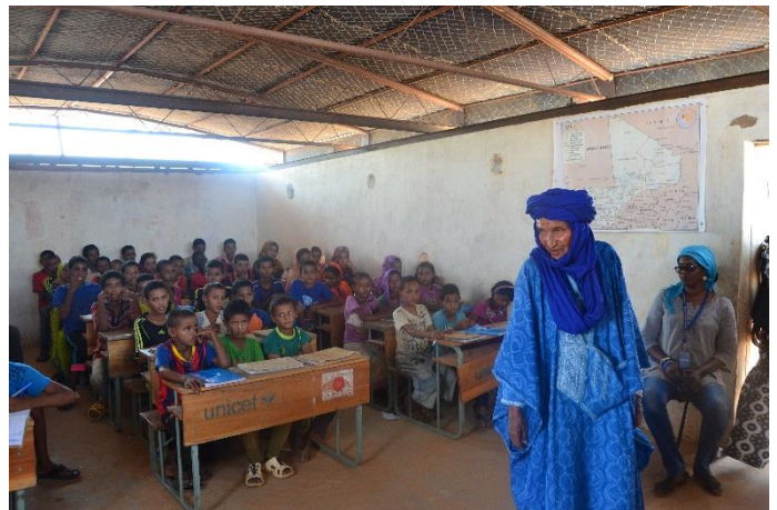
School activities started in October after summer break in Mbera camp