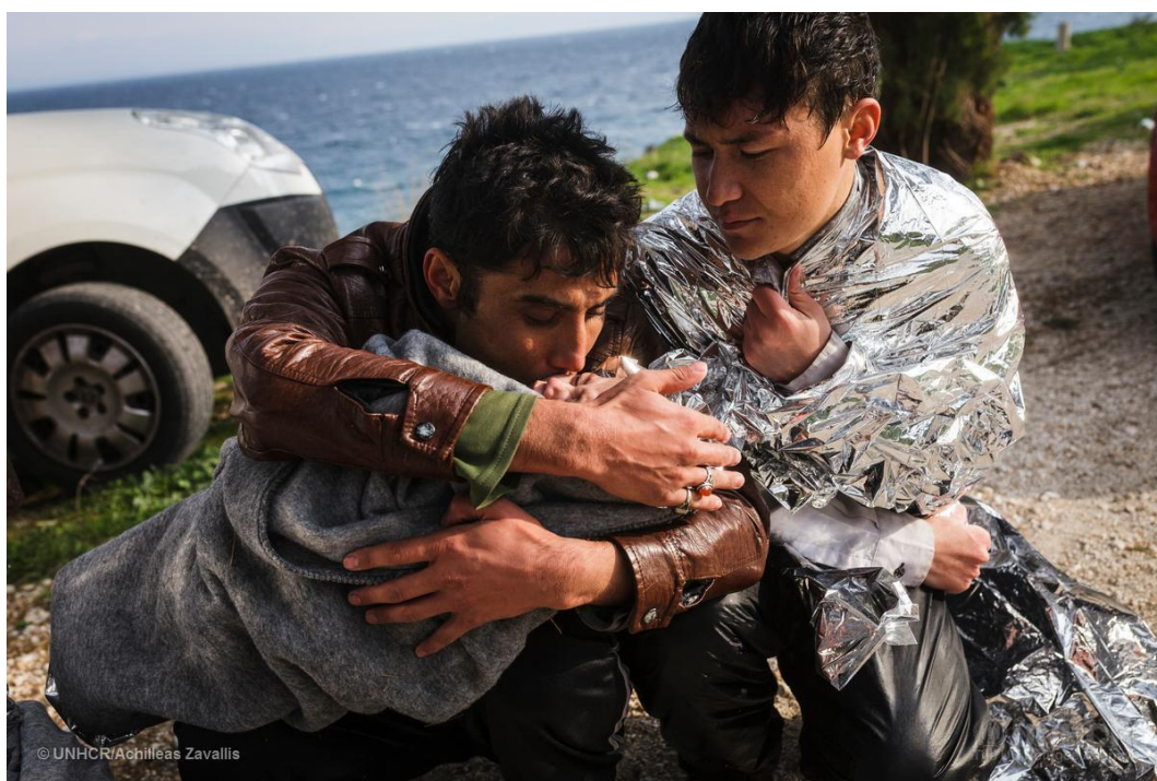
A young man from Afghanistan tries to keep his six month old baby warm shortly after reaching the shores of Lesbos, Greece

As of 27 January 2016, 257 individuals were relocated out of Italy and 157 out of Greece, totaling 414 persons relocated so far to 11 Member States. In terms of places pledged, 16 Member States and Lichtenstein have offered relocation places.