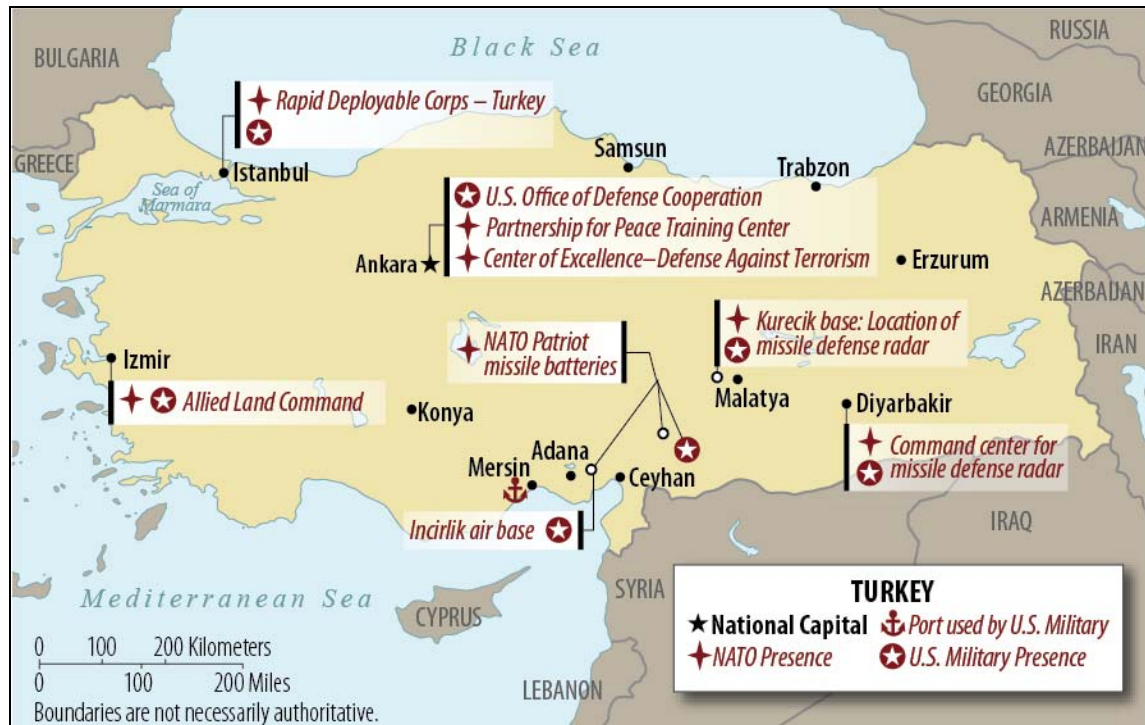
Figure 2. Map of U.S. and NATO Military Presence in Turkey