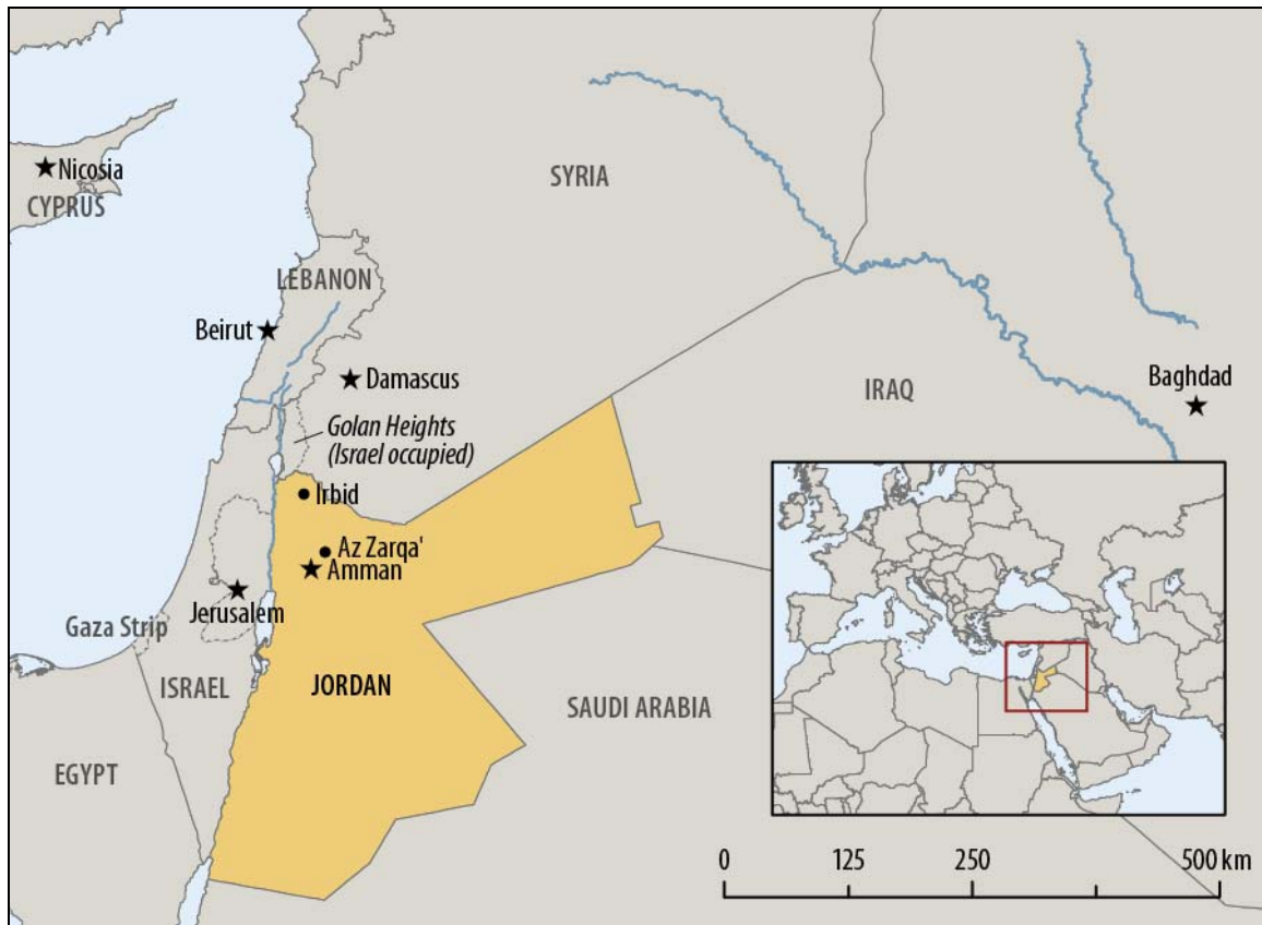
Figure 3. Jordan and Its Neighbors

Jordan's role in the conflict in Iraq is multidimensional. For years, Jordanian intelligence has permitted Iraqi anti-government groups to operate inside the kingdom, where tribal ties bind some Sunni Jordanians and Iraqis. 21 Yet, neither government wishes to see terrorist groups, such as The Islamic State of Iraq and the Levant (ISIL, sometimes called ISIS), grow in power. As a result, Jordan has agreed to host U.S. Special Operations forces' training for Iraqi soldiers inside the kingdom. According to one report, the training includes less than 100 elite soldiers from the United States, Iraq, and Jordan. 22