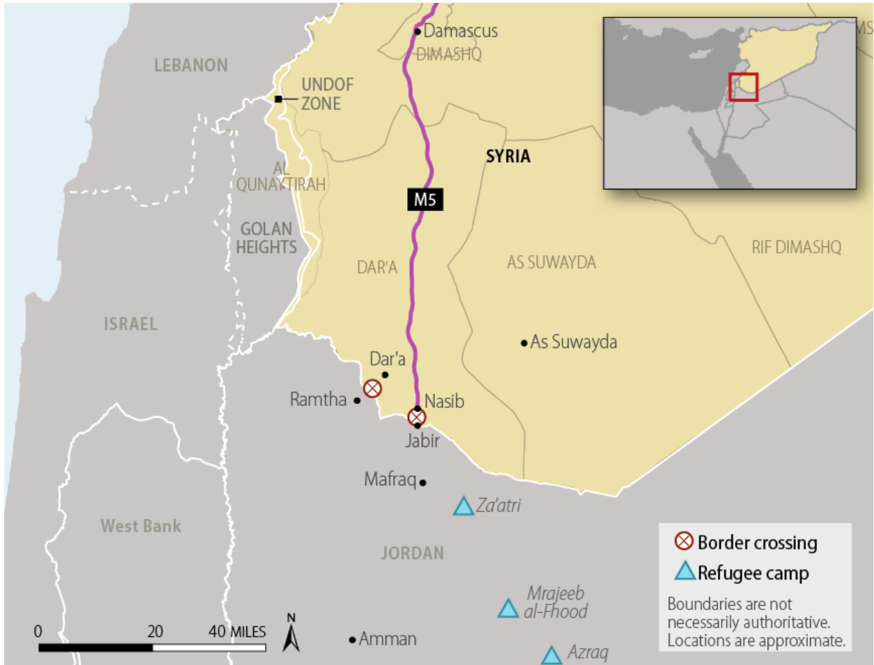
Figure 2. Syria-Jordan Border

Source: Graphic created by CRS. Borders and other elements generated by Hannah Fischer using Department of State border and Syrian refugee data (2013), Esri (2013), and the National Geospatial Intelligence Agency (2014).