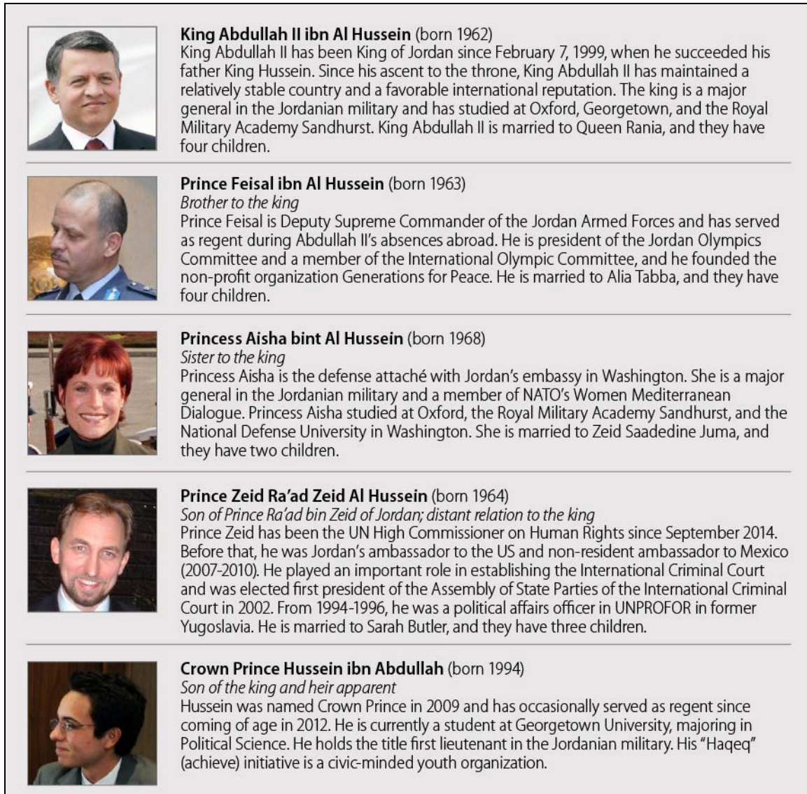
Figure 2. Select Members of the Jordanian Royal Family