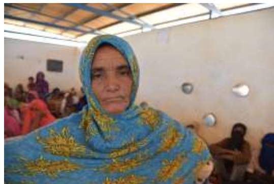
A woman attends a literacy course in Tamashek language at one of the six primary schools in Mbera camp.