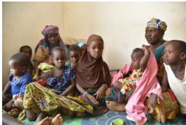
A family of two cousins and their children wait for registration in Mbera camp after having fled recent violence in Mopti.