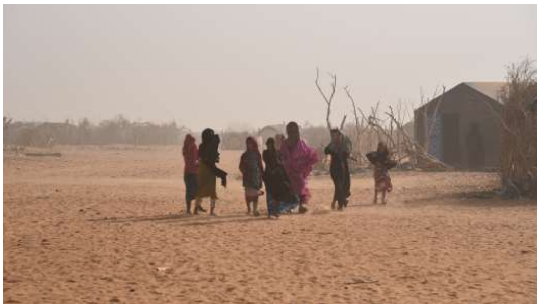
Girls bear with sandy winds to go to school in the morning. Seasonal temperatures in Mbera refugee camp raise up to 45°Celsius during the day at this time of the year.

Since 2012, UNHCR has led the humanitarian response for Malian refugees in the Hodh Echarghi region, in collaboration with the Mauritanian Government, which continues to keep its borders open to new influxes, and in cooperation with other UN agencies, national and international NGOs. Despite the conclusion of a peace agreement in Mali in June 2015, large-scale returns of refugees are not yet expected due to the security situation in northern Mali. In June 2016, Mauritania, Mali and UNHCR concluded a Tripartite Agreement for the voluntary repatriation of Malian refugees. This agreement will provide a framework to facilitate voluntary return, when the conditions in Mali will allow. In the meantime, it reaffirms the commitment of Mauritania and Mali to protect refugees. At a regional meeting in Niamey (Niger), UNHCR reaffirmed the conditions in Mali are not conducive to promote return of refugees. However UNHCR may facilitate voluntary return under request on an individual case basis.