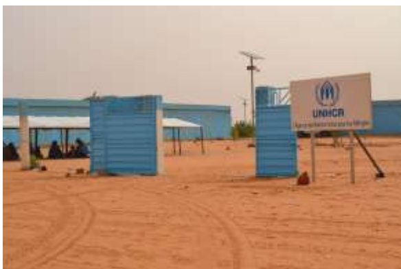
UNHCR Protection office in Mbera camp.

A total of 58,497 people are assisted by UNHCR in Mauritania.