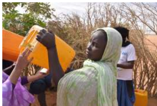
Women wash their jerry cans as part of a safe water and hygiene campaign in Mbera camp.