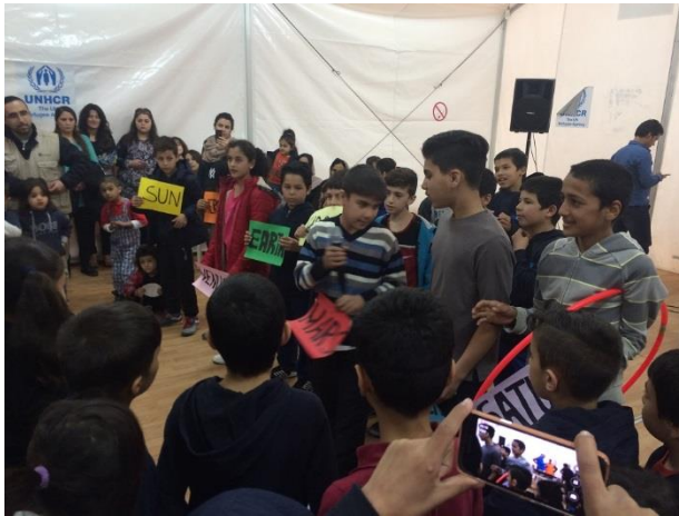
Celebrating International Women's Day, Presevo (Serbia)@UNHCR, 08 March 2017