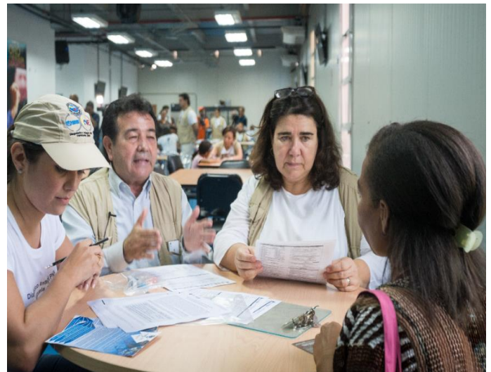
Representative of Venezuelan Government, Representative, UNHCR Regional Director and staff interviewing an asylum seeker during the launching of the Profiling exercise.