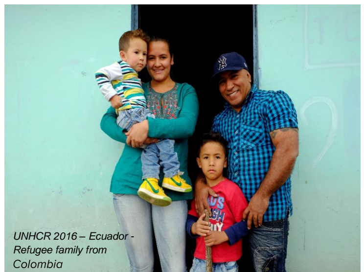
UNHCR 2016 – Ecuador - Refugee family from Colombia