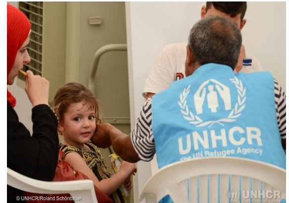
Pre-registration for refugees like this Syrian family in Greece to assist in accelerating solutions for them.