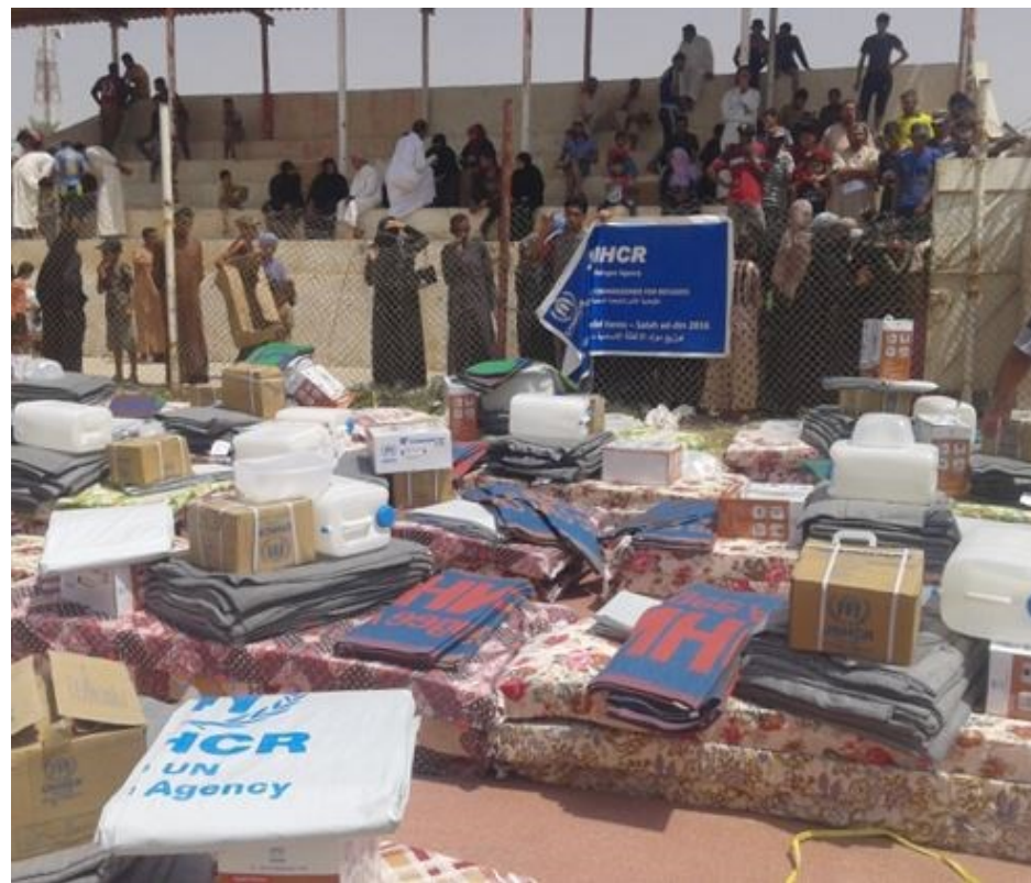
UNHCR distributed mattresses, water jerry cans, and other essential basic items to 315 IDP families newly arriving into Tirkit in Salah al-Din Governorate on 20 August. Since 15 July, UNHCR has distributed over 1,300 kits of core relief items to out-of-camp IDPs in Tikrit.