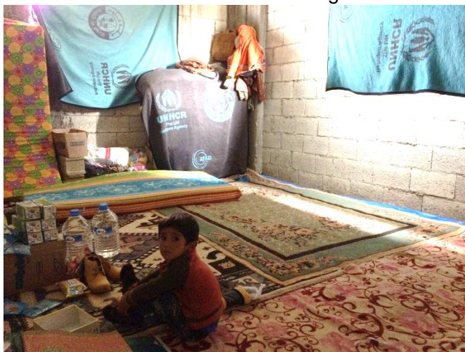
A semi constructed building in Onbir nisan district, where 7 families of 35 persons are living since one month

AFAD reported on 17 October there are 5,100 Syrian refugees hosted in the buildings and tents at the YIBO shelter. AFAD informed UNHCR that the area system currently in use in the camps in Turkey will also be applied to YIBO. AFAD started to set up 30 additional tents expected to be ready on the 21 October. Latrines, showers and electricity are also being set up.