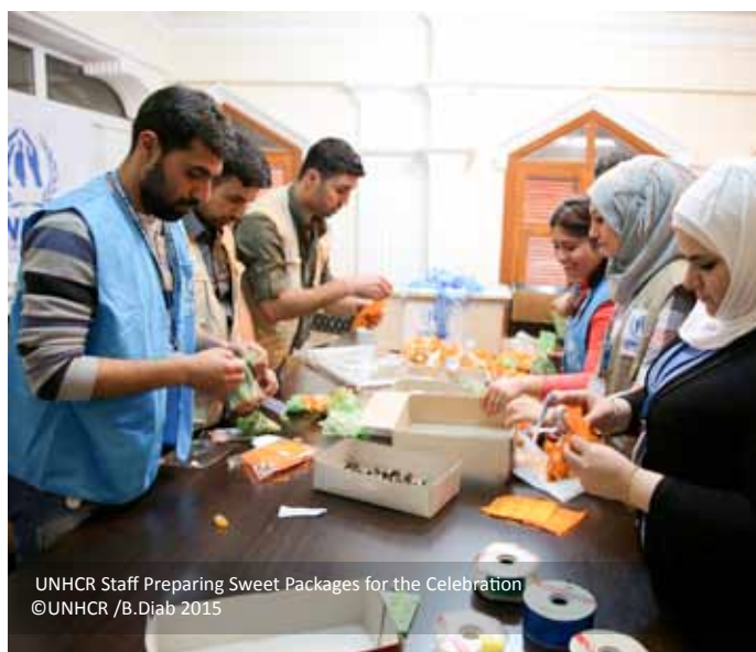
UNHCR Staff Preparing Sweet Packages for the Celebration

UNHCR has been providing protection and assistance such as standard CRI kits, heaters, rechargeable fans, tents and wheelchairs to the population since August 2014. In addition, UNHCR has also provided medicine to residents through local organizations working in the area.