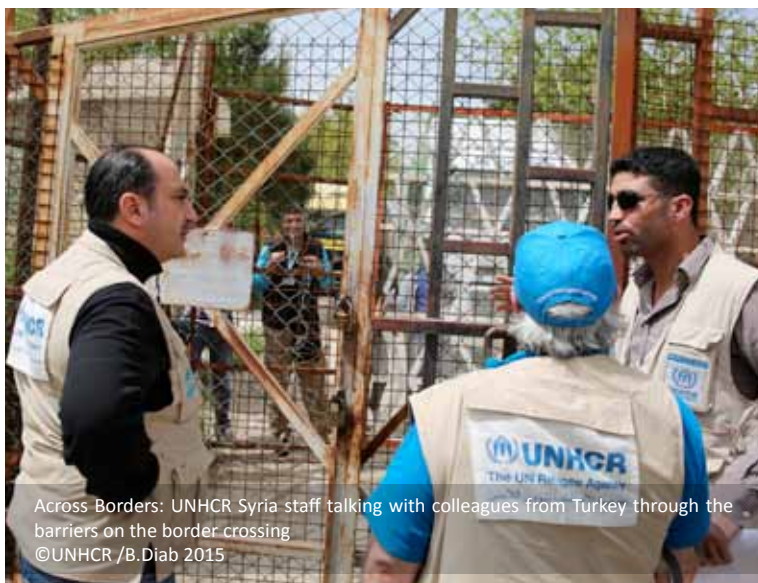
Across Borders: UNHCR Syria staff talking with colleagues from Turkey through the barriers on the border crossing