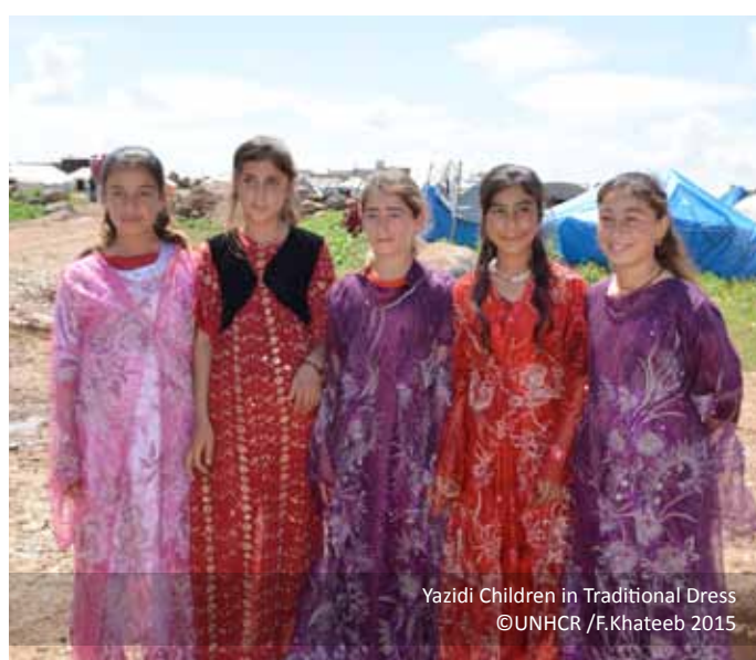
Yazidi Children in Traditional Dress