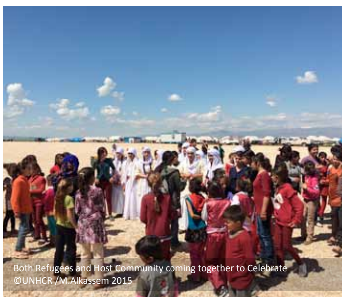
Both Refugees and Host Community coming together to Celebrate