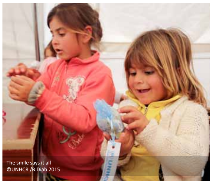
The smile says it all