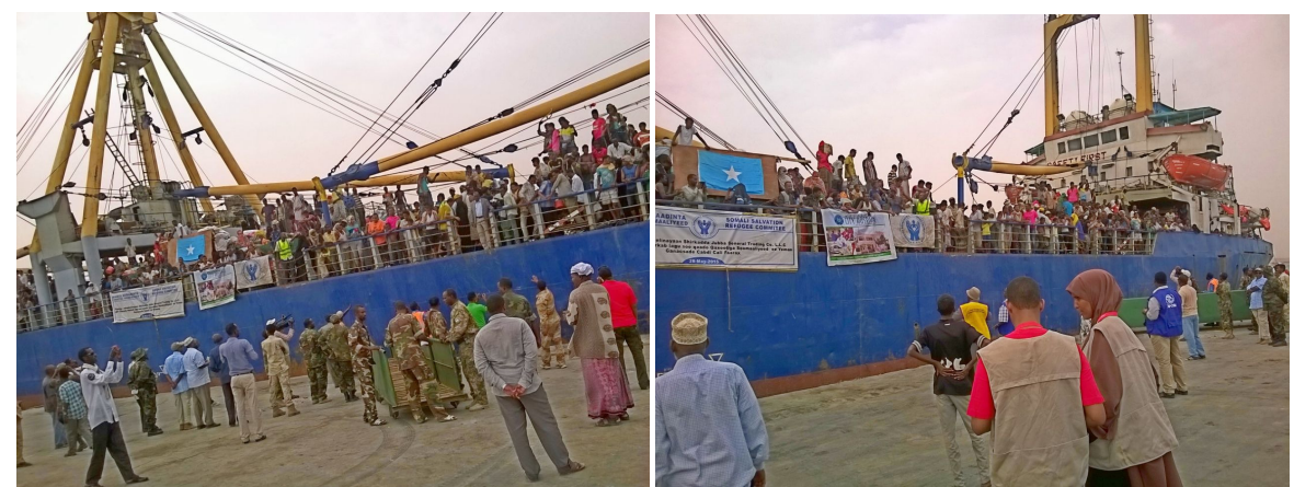
Arrival of Nawal cargo ship, carrying 2,019 people fleeing Yemen, at Bossaso Port on 13 June 2015

New Arrivals | During the reporting period, three boats arrived in Bossaso, on 13 June. The first boat was named Faxtul Kheyr and carried 9 people in total (3 females, 2 males and 4 children). The second boat was named Shamis and carried 75 people in total (22 females, 19 males and 34 children). The third boat was named Nawal and contained 2,019 people in total (633 females, 445 males and 941 children). Among the new arrivals there were 1,873 Somali nationals, 220 Yemenis and 10 Ethiopians.