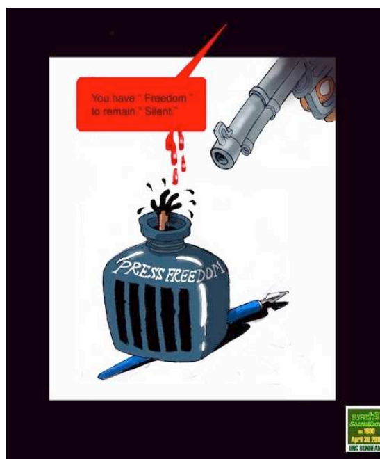
Figure 4.1: Cartoon by Sacrava, Sacravatoons No. 1690, April 2010

Despite the importance of a free, pluralistic media for the furthering of democracy, the AHRC has found that in Cambodia the pattern of freedom of press since 1993 has been one of overall decline with spurts of freedom over short periods of time. 89 Restrictions have swung wildly between freedom and repression and as such the press "cannot be described truly as free." 90 Since 1993, eleven journalists, most recently Khim Sambo of opposition paper Moneaksekar Khmer , have been killed. 91 To date no arrests have been made in relation to the murder of Khim Sambo. Journalists continue to be threatened and harassed, with defamation cases against journalists being used to stifle debate and discussion. Opposition papers have