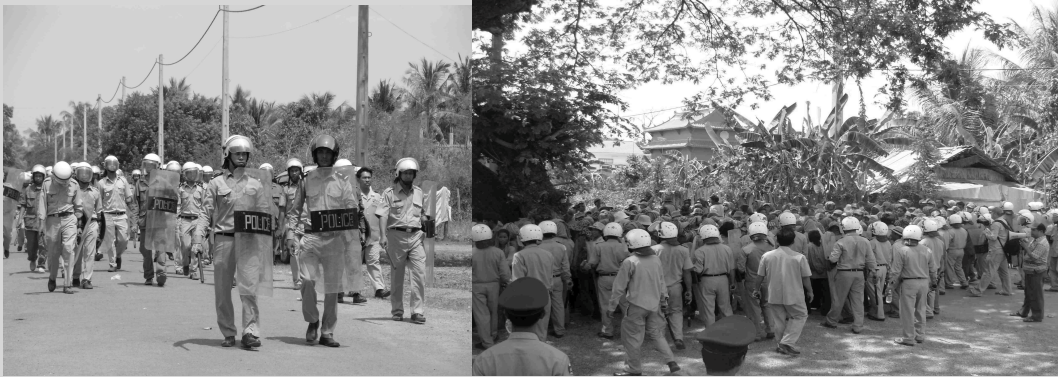
Figure 7.2: Military police face peaceful protestors in Kompong Speu, March 2010

Following the arrest and detention of two community representatives, You Thou and Khem Vuthy, in connection with a land dispute involving Phnom Penh Sugar Company, which is owned by CPP Senator Ly Yong Phat, affected villagers drove to Kompong Speu Provincial Court. Villagers drove for hours to stand outside the courthouse in a show of solidarity with the arrested representatives. Police forces (made up of a mixture of criminal and military police) attacked their convoys with batons, disabling one mini-tractor by cutting its drive belt and setting up checkpoints to impede villagers' progress. 179 NGOs monitoring the situation reported that at least 3 villagers were beaten and 7 suffered minor injuries. The actions of the mixed police force represent an unpalatable infringement on freedom of expression and freedom of assembly, denying those affected by the land dispute the opportunity to voice their concerns.