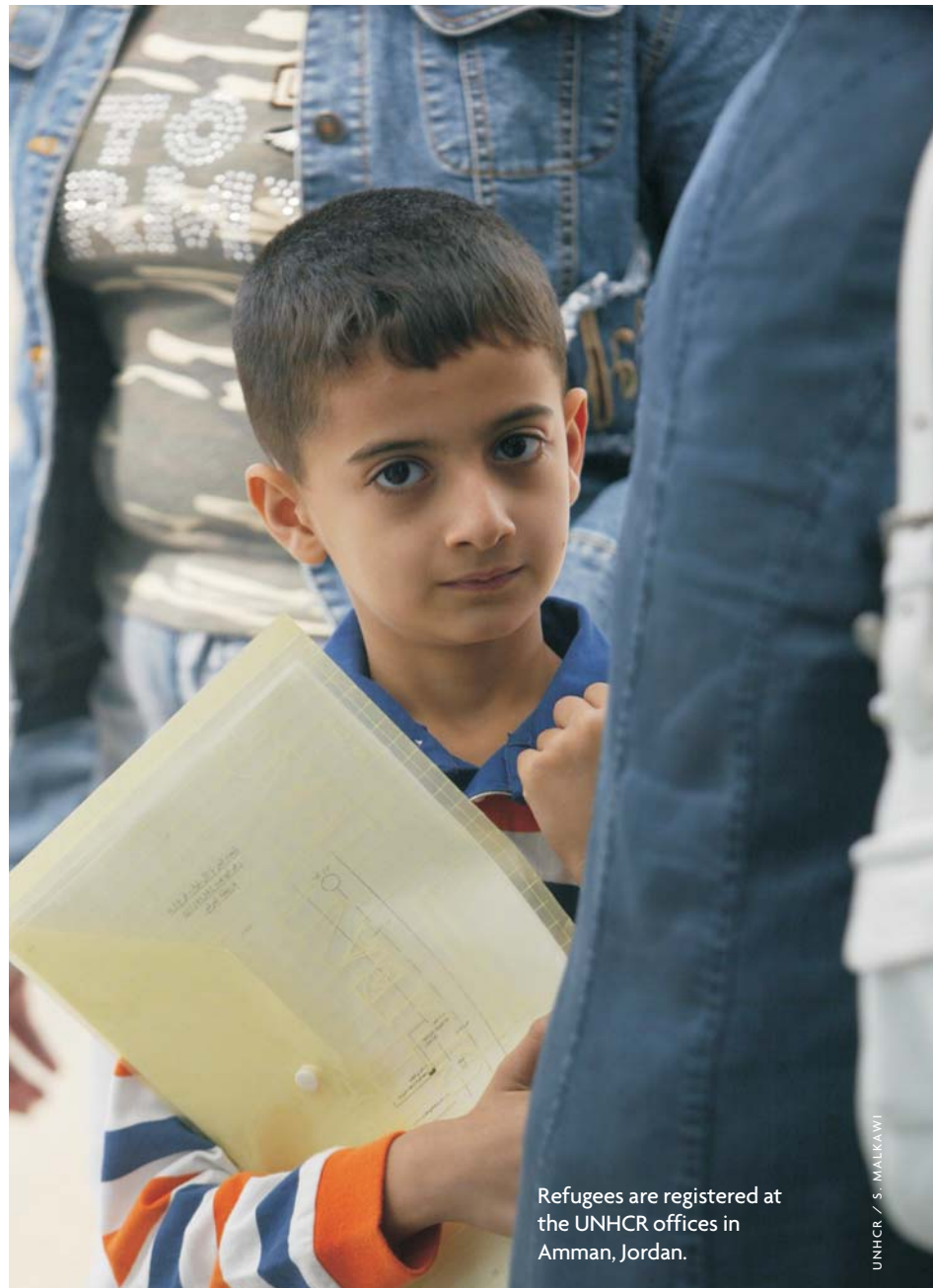
Refugees are registered at the UNHCR offices in Amman, Jordan.