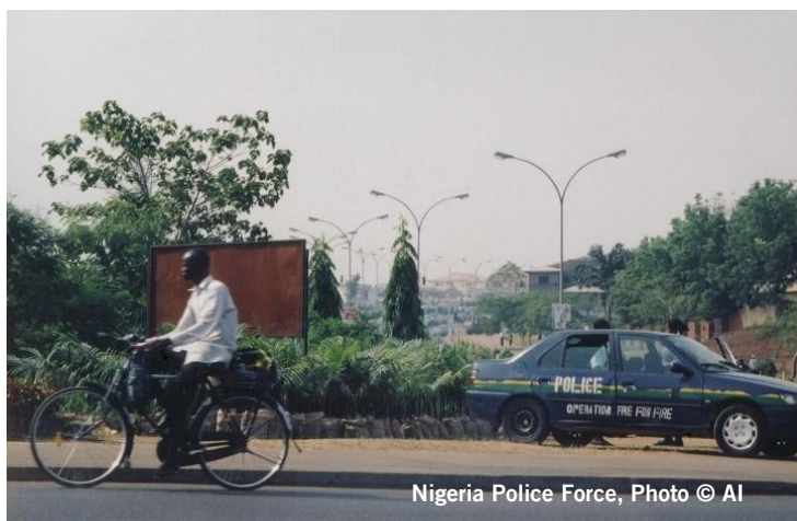
Nigeria Police Force

Amnesty International welcomes the adoption by the House of Representatives of the motion ‘Upsurge in cases of Armed Robbery and Shooting of Nigerian in South Africa’, on 17 April 2008 and the adoption by the Senate of a motion ‘Armed Robbery and Violent Attacks on Nigerian in South Africa: Time for Decisive action’ on 23 April 2008. Extra-judicial executions and torture are a serious concern for Amnesty International in many parts of the world, including Nigeria.