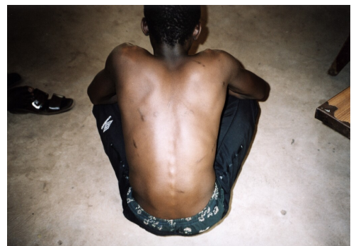
A prison inmate who says he was tortured by the police.

The Nigerian Police frequently use torture while interrogating suspects, despite section 34 of the Nigerian Constitution, article 7 of ICCPR and the Convention against Torture. In a study published in 2000 the Nigerian Human Rights Commission and the NGO Centre for Law Enforcement (CLEEN) stated that almost 80 percent of inmates in Nigerian prisons claim to have been beaten by police, threatened with weapons and tortured in police cells. 12 Torture and other ill-treatment are prohibited at all times, in all circumstances. No exceptional circumstances – including