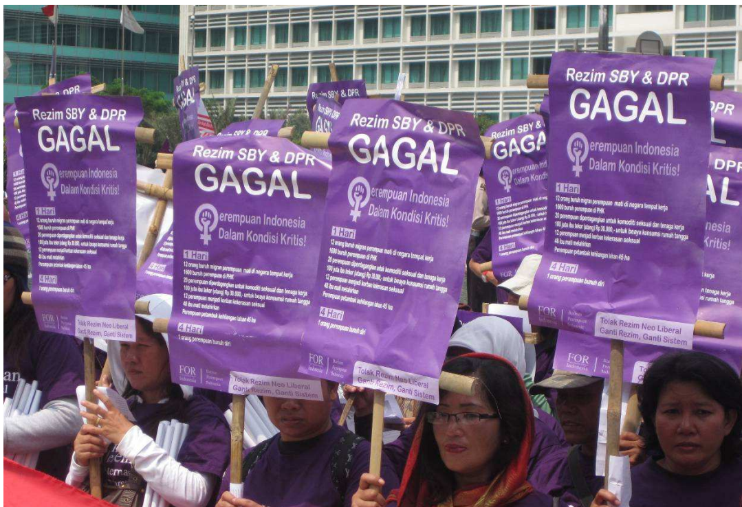
Demonstration on International Women's Rights Day highlighting how the government has failed women in Indonesia. March 2010.

Amnesty International is calling on the Indonesian government to repeal all laws and regulations, at both the central and local levels, that violate sexual and reproductive rights, ensuring that women and girls can realise their rights to be free from coercion, discrimination and the threat of prosecution and punishment.