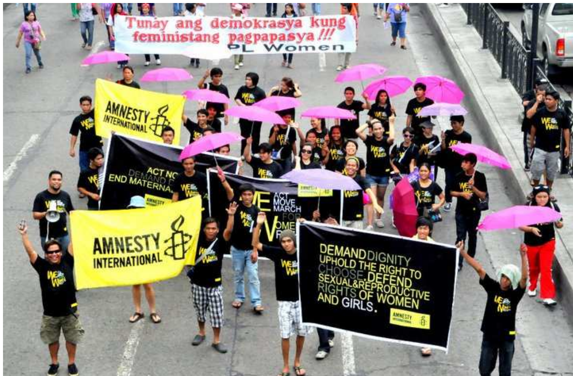
Amnesty International Philippines joins street demonstration for International Women's Day, March 2011.