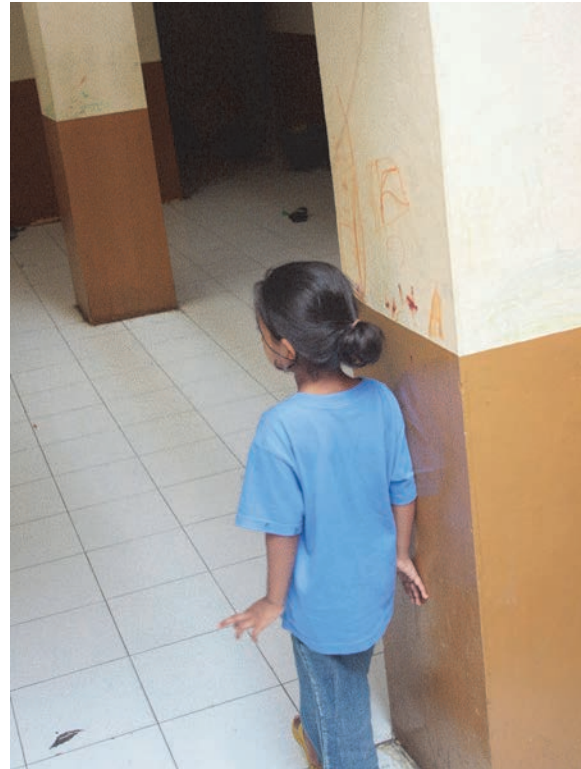
An asylum-seeking girl, thought to be from Sri Lanka, walks through Belawan Immigration Detention Center while detained with her family, September 2012.