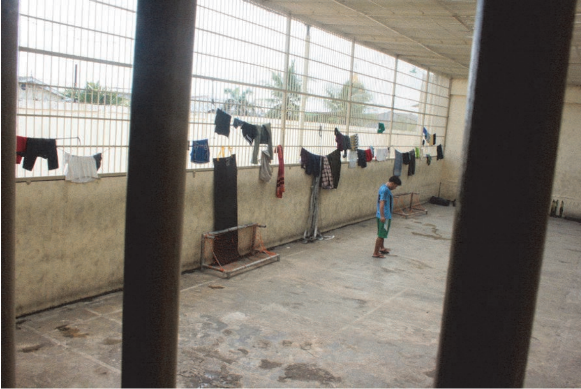
An Afghan asylum-seeker walks in the courtyard used for outdoor recreation time at Belawan Immigration Detention Center, September 2012. Some interviewees reported being held for months without access to recreation spaces.

According to our interviewees, access to recreation seemed to be at the whim of immigration staff. Faizullah A., also from Afghanistan, was 17 years old when he was detained for seven-and-a-half months at Pontianak IDC: