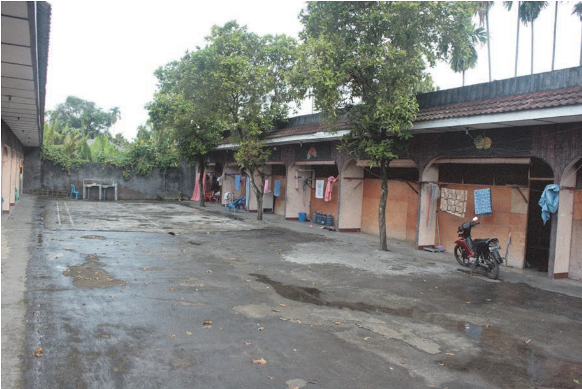
Living center for asylum seekers and refugees in Medan, northern Sumatra. Even once released from detention, asylum seekers and refugees must live in certain areas and cannot move freely about the country. Families living here reported flooding, overflowing sewage, and concerns about neighborhood crime.