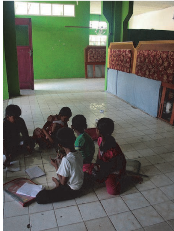
Rohingya children seeking asylum with their families attend an English class sponsored by the International Organization for Migration at a living center for asylum seekers in Medan, September 2012.

Though many children do not have access to formal education, IOM in collaboration with some local NGOs provide some informal education, including English classes, for refugees and asylum seekers who fall under IOM care. 259 Yet IOM’s programs are not sufficient to replace formal education programs. Under international law, a child’s nationality cannot