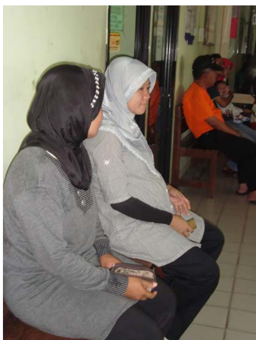
Women at a community health centre, Java.

The right to equality before the law is provided for in the Indonesian Constitution (Article 27.1) and the Human Rights Act (Article 3.2). The right to non-discrimination is also provided for in the Constitution (Article 28.1 (2)) and the Human Rights Act (Article 3.3).