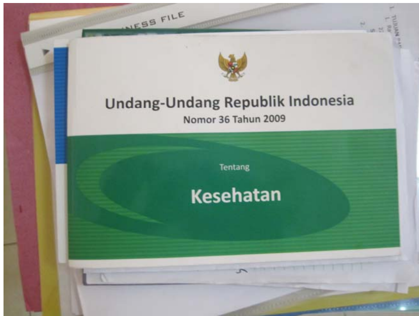
The new Indonesian Health Law passed in 2009 which now allows access to abortions in the case of pregnancy resulting from rape.

“This is the first time I hear about it [the legal provision for rape victims in the 2009 Health Law]” a Jakarta-based doctor who works at a local community health centre, March 2010. 121