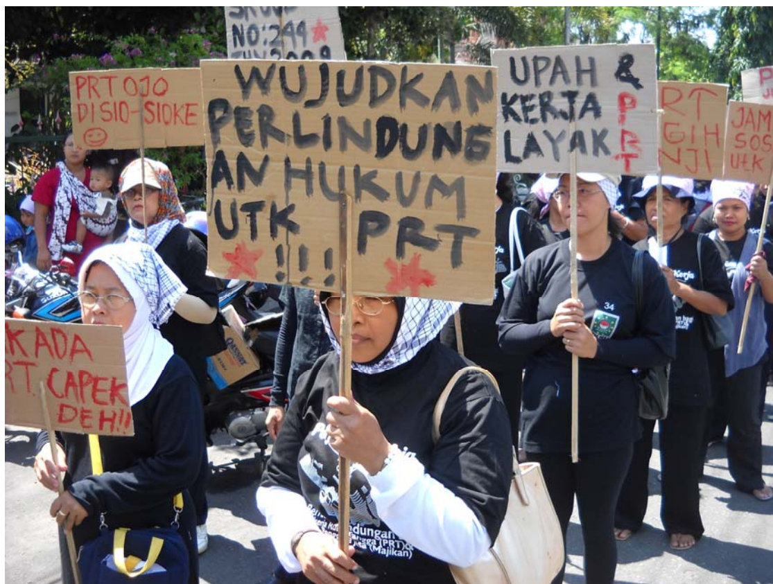
Women domestic workers demonstrating for their rights, including protection under the law, February 2010.

This lack of legal protection for domestic workers is in violation of international human rights law and standards pertaining to workers' rights. In particular, by excluding women and girl domestic workers from legal protection in relation to their gender-specific needs, the state is in violation of its obligations as a state party to CEDAW, 151 CRC, 152 and the ICESCR. 153