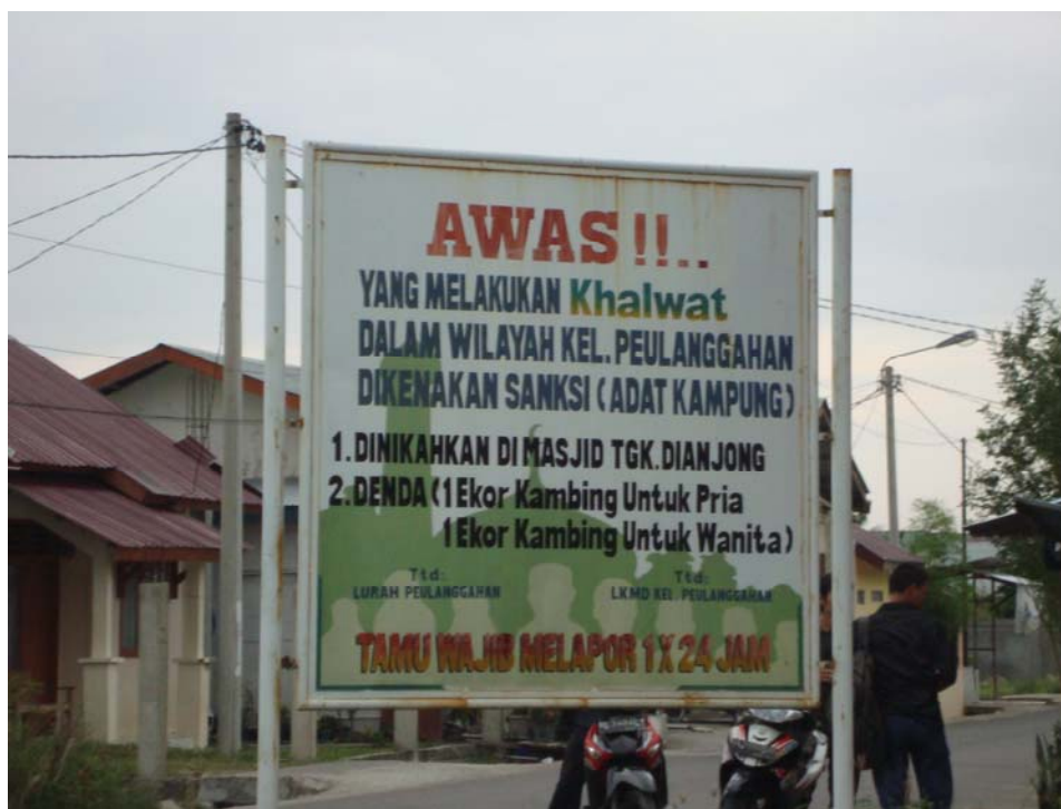
Signpost warning the local community in Aceh that khalwat is prohibited. Khalwat is defined as two unmarried adults of the opposite sex who are not close relatives and who are together without the presence of other people.

Many people misunderstand khalwat , believing that it only criminalizes sexual relations outside marriage when in fact it criminalizes merely being alone with someone of the opposite sex who is not a relative. 65 According to the Commission, the application of the bylaw on khalwat has led to “mistaken” arrests and detentions. In some cases, these arrests and detentions have also led to women being forced to admit that they had sexual intercourse with someone who is not their husband. In one case, it led to the long-term exclusion of a woman from her village because she was stigmatized by the community at large as a result of the assumption that she had sex outside marriage. 66