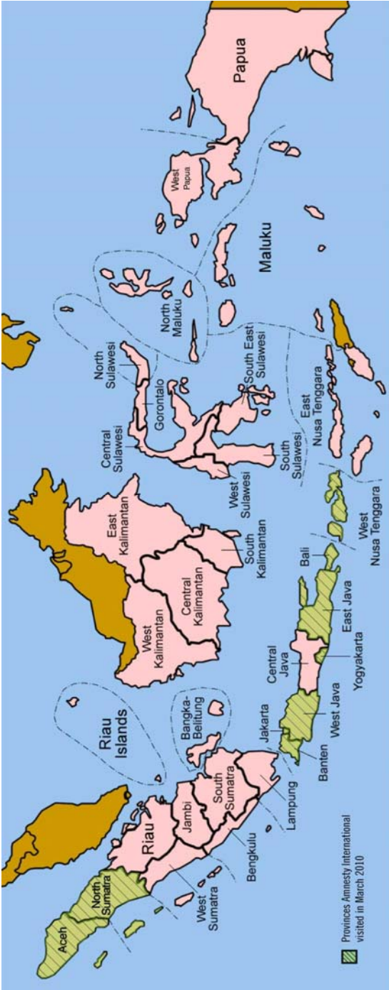
Provinces in Indonesia