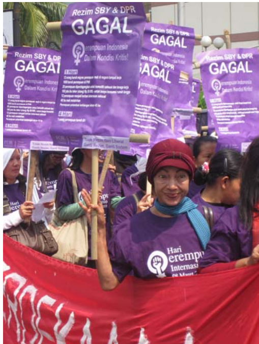
Demonstration on International Women's Rights Day highlighting how the government has failed women in Indonesia, 8 March 2010.

This report also follows on from Amnesty International's 2009 report, Unfinished Business: Police accountability in Indonesia , which highlighted, among other things, the vulnerability of women and girls from poor and marginalized communities, in particular in urban settings, to police abuse without adequate access to legal remedy. 13