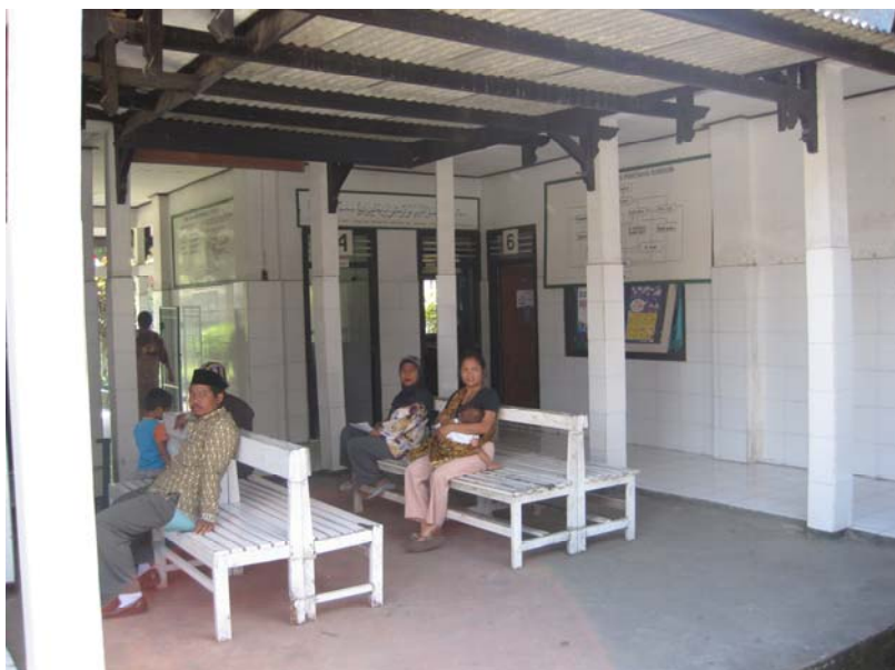
Mother and child waiting in a community health centre, Eastern Indonesia.

Further, CEDAW requires states parties to “ensure to women appropriate services in connection with pregnancy, confinement and the post-natal period, granting free services where necessary, as well as adequate nutrition during pregnancy and lactation” (Article 12.2).