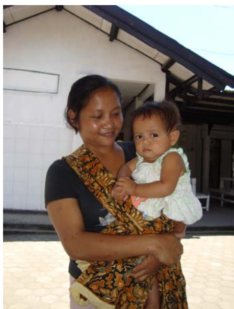
Mother and child at a community health centre, Eastern Indonesia.

With only five more years to go in the MDG timeframe, little progress has been made in the daily realities of women and girls in Indonesia to address these concerns. 167 Certain laws, regulations or mechanisms have been put in place at the local and central levels to address gender discrimination and gender-based violence, 168 and some policies have aimed at disseminating gender-awareness within the administration and among health providers. 169 However, these measures and their impact have been counter-balanced by other pervasive discriminatory practices and attitudes, which are either embedded in laws, regulations and policies, or are part of traditional attitudes or practices which are discriminatory towards women and girls, in particular as regards to sexual and reproductive rights.