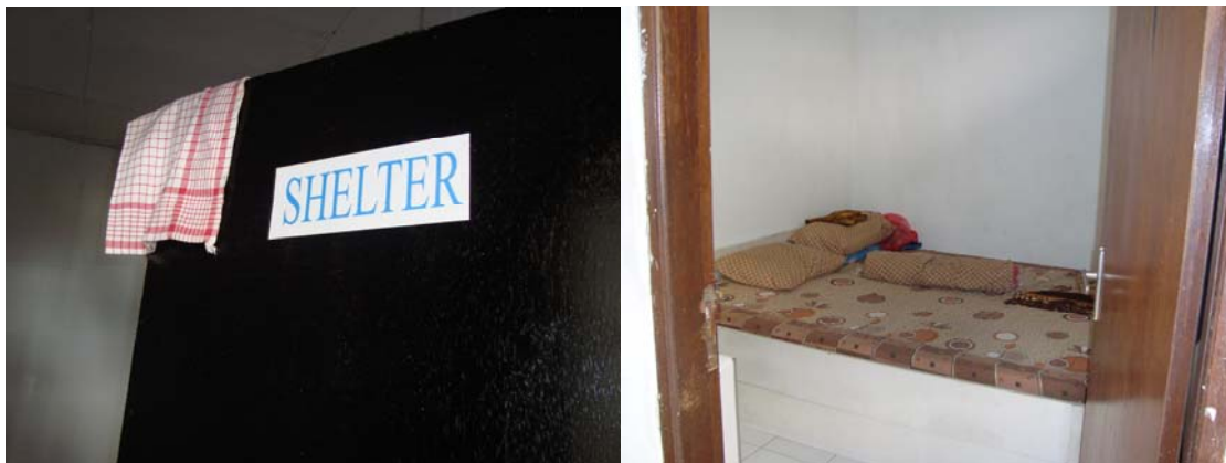
Non-governmental shelter for women and girl victims of abuse, Eastern Indonesia.

When the state fails to ensure rape victims are guaranteed access to health care in practice, it violates women's sexual and reproductive rights; moreover the state is failing in its duty to provide the reparation to which victims are entitled under international human rights law and standards.