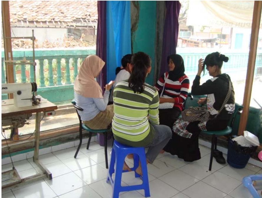
Girl domestic workers between the ages of 13 and 15 years old, Java. Child domestic workers often work in isolation and are vulnerable to physical, psychological and sexual violence. Domestic workers are legally protected under the Domestic Violence Law.

For women and girls who become pregnant as a result of sexual violence, these obstacles also become barriers to ensuring that they can access the reproductive health care they need. For example, although rape victims are now legally entitled to abortion services, they can only legally access these services after reporting to the authorities and within the first six weeks of pregnancy (see Chapter 4, “Unsafe abortions and the threat of criminalization”, p33.