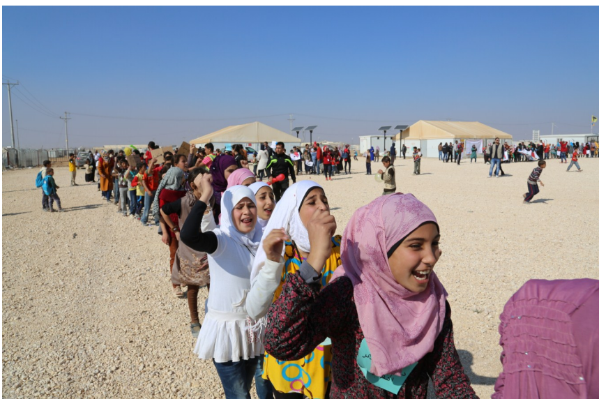
On Universal Children's Day, 20 November, approximately 600 children gathered at one of the 37 Child Friendly Spaces in Za'atri camp.

• Save the Children (SC) is carrying out a range of activities across the region to promote protection, education and the health and wellbeing of children. SC is working to provide children with school bags, uniforms, and other essential school materials, and pay school fees. They are also providing non-formal education for adolescents and Early Childhood Education for under-fives, in addition to running child-friendly and youth-friendly spaces that reach thousands of children; and carry out a range of child protection activities including resiliency activities and establishing, training and supporting community child protection committees. SC plans to reach 1.3 million beneficiaries in Syrian refugee-hosting countries by the end of 2015, including over 675,000 children.