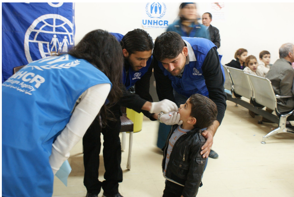
MOH, IOM and UNHCR in Khalda Registration Centre, Amman, where on average 150 children and youth are vaccinated daily.