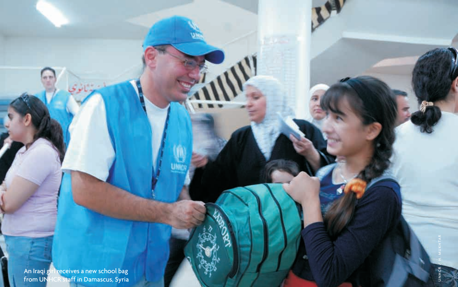
An Iraqi girl receives a new school bag from UNHCR staff in Damascus, Syria