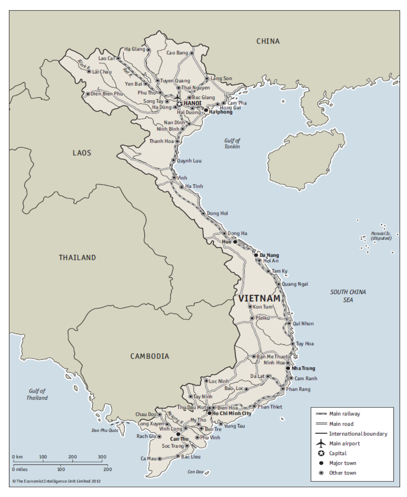
[15a] (p2) The Economist Intelligence Unit, Country Report, March 2012)

For further maps of Vietnam see ReliefWeb's Map Centre.