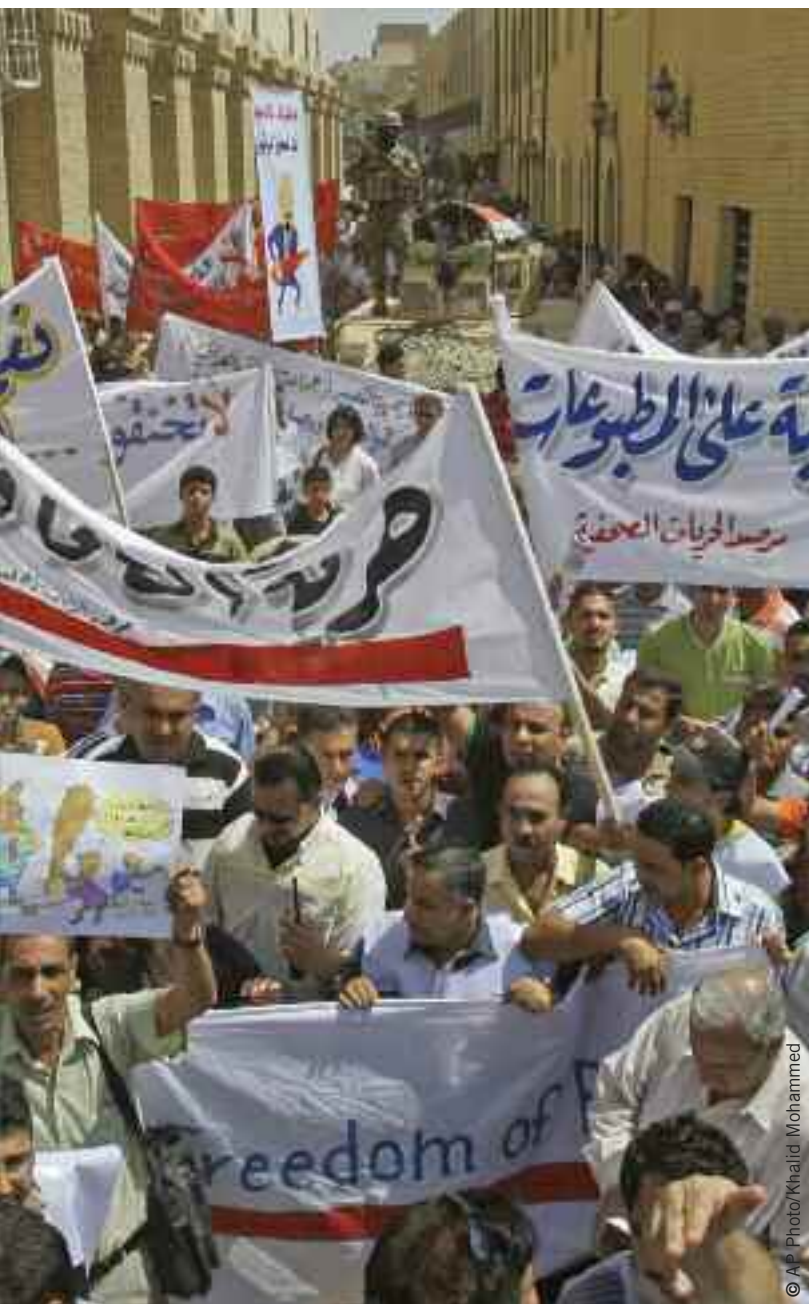
Demonstrators in Baghdad demanding freedom of the press, August 2009.

notably by members of Islamist armed groups and militias. Some have been attacked and killed because of their efforts to promote gender equality.