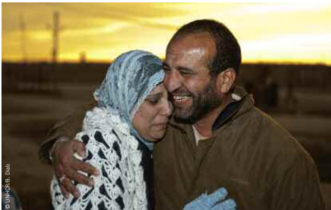
A former resident of al-Tanf refugee camp, which was closed in February 2010, is reunited with her brother in al-Hol camp, northern Syria. The pair had not seen each other since 2006.