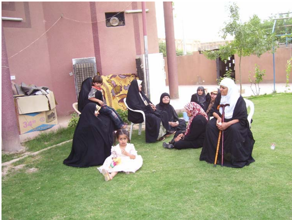
Mothers and relatives of detainees wait to be interviewed by Amnesty International May/June 2008

All Islamist detainees who have been released following amnesties, including amnesties issued by the President of the KRG, have been required, as a condition of their release, to report to the Asayish on a weekly basis and are not allowed to travel outside the governorate in which they reside without permission from the Asayish . If the released person fails to honour these conditions or commits a criminal offence, the Asayish can redetain him and confiscate his house or the house of a guarantor that he has nominated.