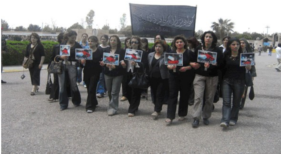
Women demonstrating against an honour killing in front of the Kurdistan Parliament, Erbil 2007.