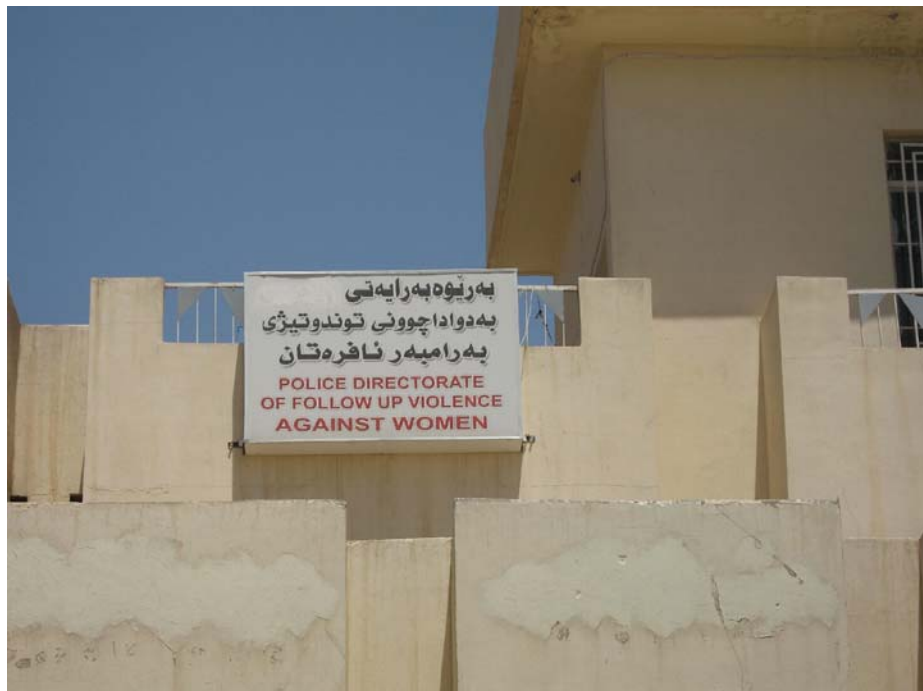
Police Directorate to Combat Violence Against Women, Erbil

While the suffering of many women victims of violence goes unnoticed by the authorities there has been an increase in the number of complaints filed against perpetrators of violent acts against women. In some cases, women have filed complaints directly with the authorities; in others, this has been done through the assistance of women's rights organizations. Hotlines for women at risk have been established by the authorities and NGOs.