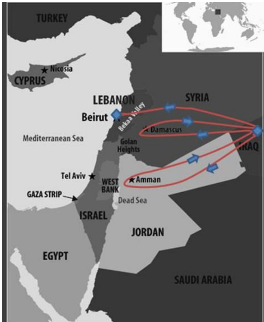
Map 2: One Iraqi migration pathway between Iraq and host countries