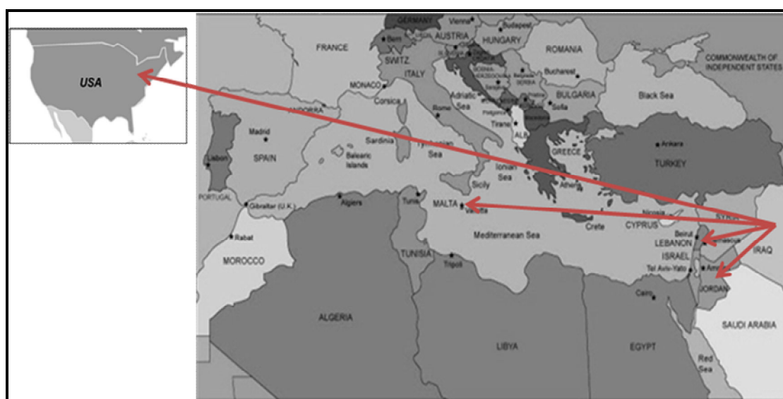
Map 3: One family, multiple destinations: Migrations for four Iraqi siblings

In some cases, Western resettlement criteria are set according to sectarian affiliation. Germany and France were reported to be interested in resettling Christian refugees only, an issue opposed by UNHCR (PMSYR3, 20 April 2011).