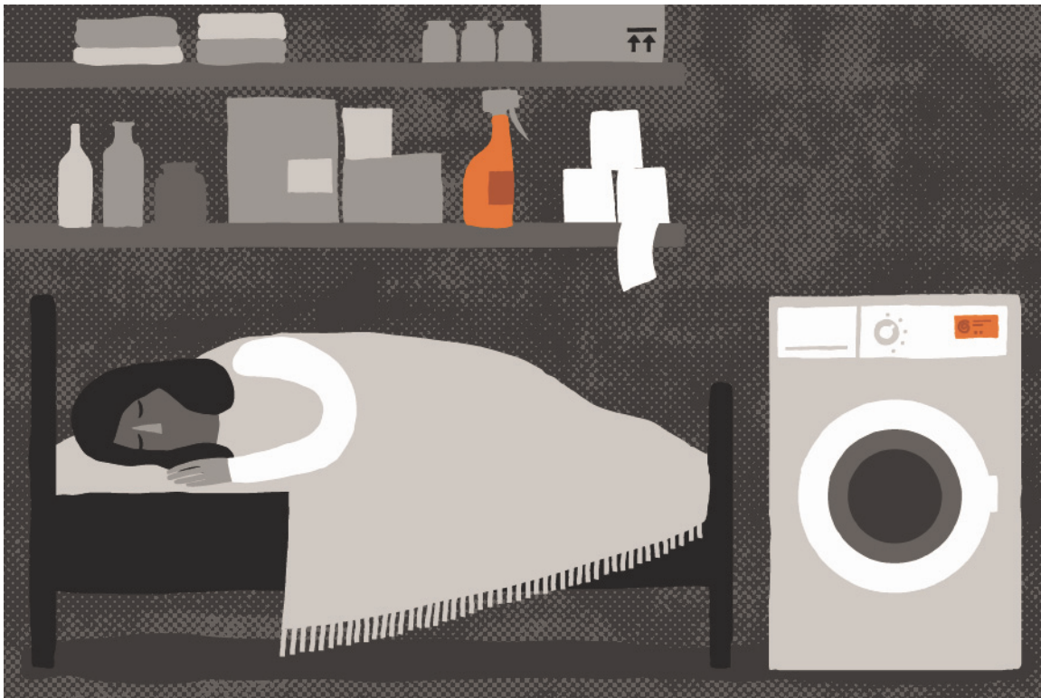
Inadequate sleeping conditions