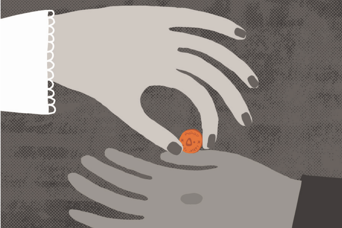
Not paid full salaries or at all

Omani law does not provide, such as minimum salaries. But they can do little to enforce these protections once their nationals are in the country.