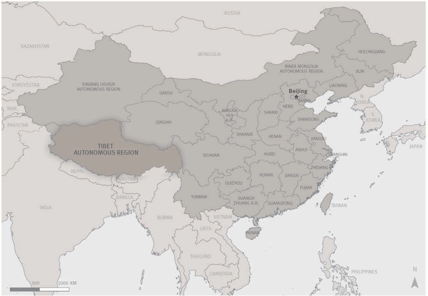
MAP OF CHINA