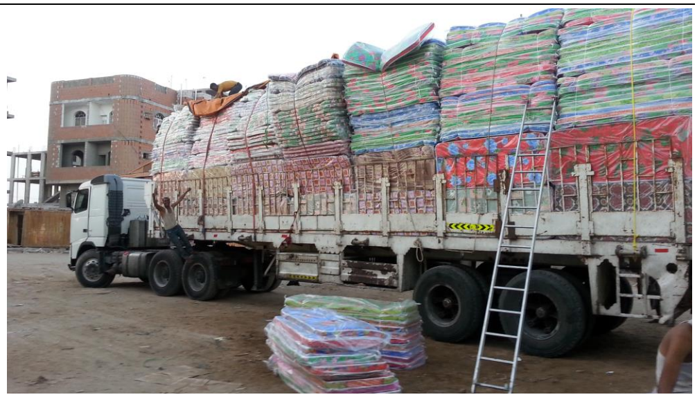
families in Dhamar. UNHCR Distribution of mattresses in Aden by Society for Humanitarian Solidarity, Yemen.

From 10 to 15 November, UNHCR's partner the Yemen Red Crescent (YRC) distributed CRIs to 471 IDPs in Amran and Hajjah, and the partner Adventist Development and Relief Agency (ADRA) distributed NFIs to 1,572 IDPs in Sana'a. UNHCR partner Humanitarian Forum (YHF) is presently distributing CRIs to 198 IDP families in Al Mahwit, and 1,000 IDP