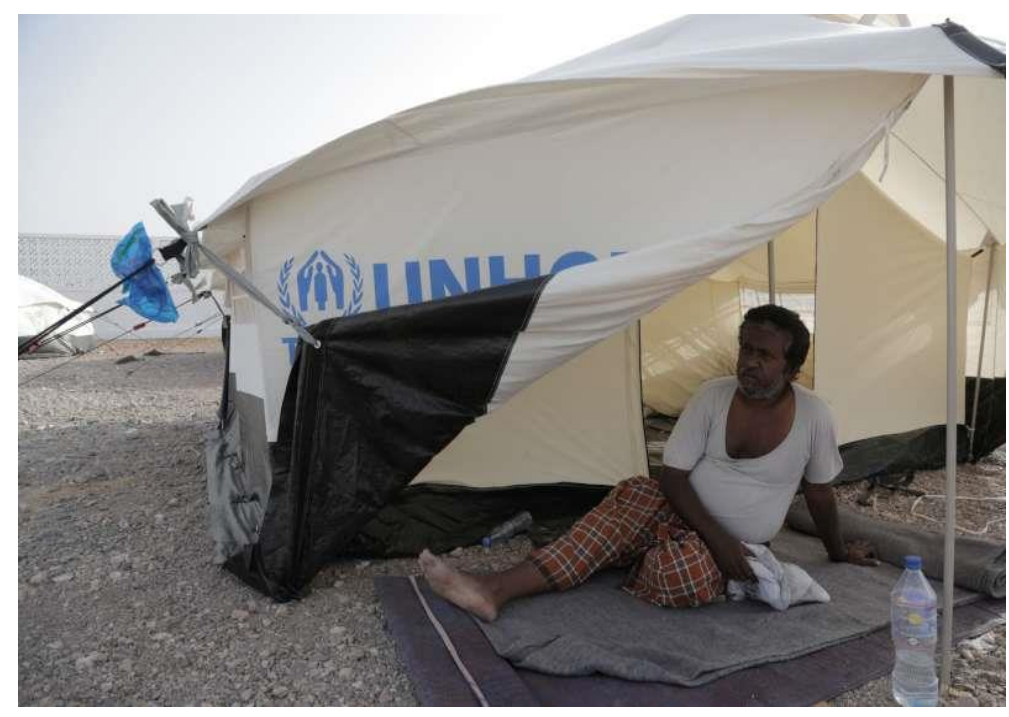
A refugee from Yemen hides from the scorching sun in Obock, Djibouti. Obock has become a safe haven for hundreds of people fleeing increasingly violent conflict in Yemen.