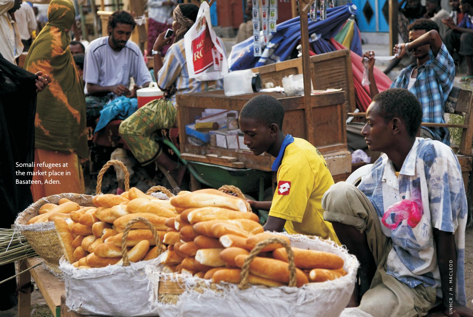
Somali refugees at the market place in Basateen, Aden.