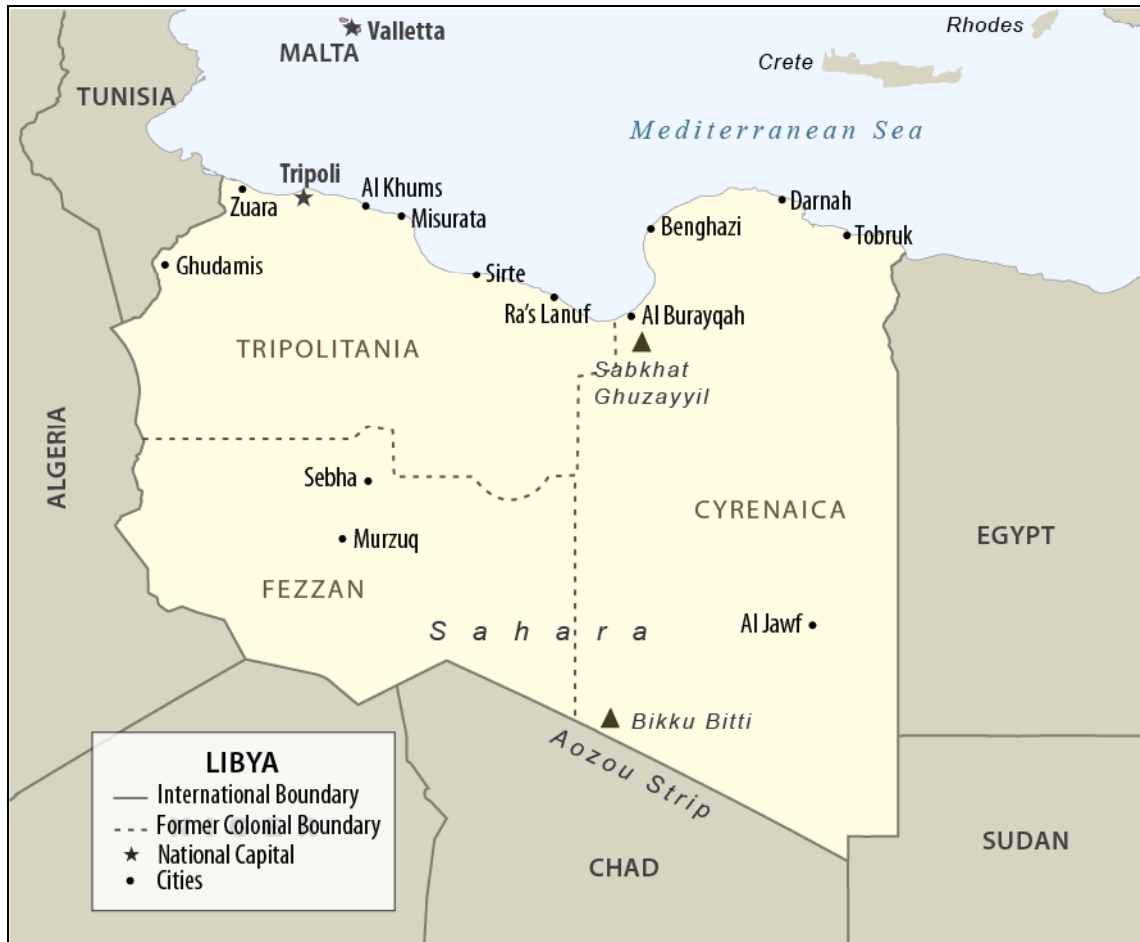
Figure 2. Political Map of Libya