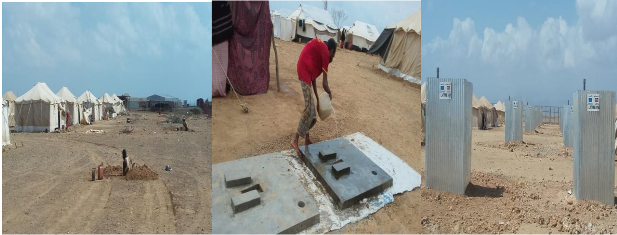
Different stages of latrine construction at Markazi Camp. ©NRC/December, 2015.