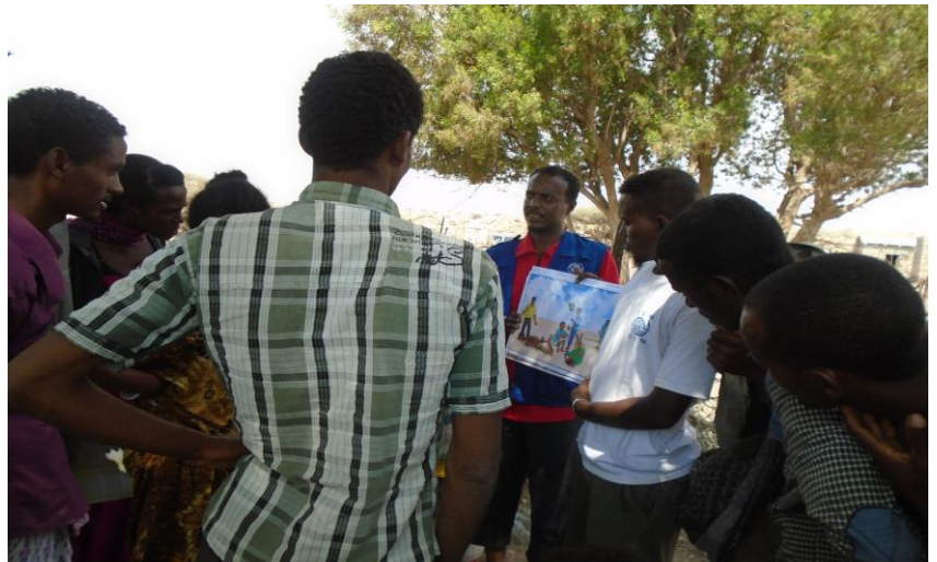
IOM discusses with migrants the dangers of illegal migration. ©IOM/Nov. 2015.

During the reporting week, IOM received 10 migrants requesting assisted voluntary return to Ethiopia. There are currently 31 migrants including nine unaccompanied children hosted at the Migrant Reponse Centre (MRC) in Obock and waiting to be transported to the Ethiopian Embassy in Djibouti for documentation before travelling to Ethiopia. In the meantime, they receive shelter, food, documentation and medical assistance from IOM. A total of 3,851 migrants have returned to their countries of origin, to date.