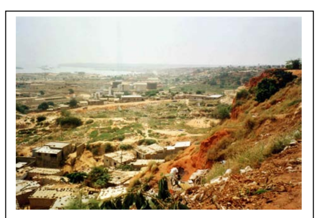
View of Boavista showing the area in which houses were demolished. @ AI, May 2003

Boavista, one of the oldest musséques in Luanda, is situated between the port area of Luanda and a luxury residential suburb, from which it is separated by a winding cliff. Under heavy rain, parts of the cliff wash down, engulfing adjacent houses. Evictions in Boavista took place without meaningful prior consultation and in the first week two people were killed and others injured after police opened fire. More than 4,000 families were forcibly evicted from Boavista between June and September 2001 and transported to Viana municipality, over 40 kilometres south east of Luanda, where they lived in tents until about half of them were rehoused in 2003.