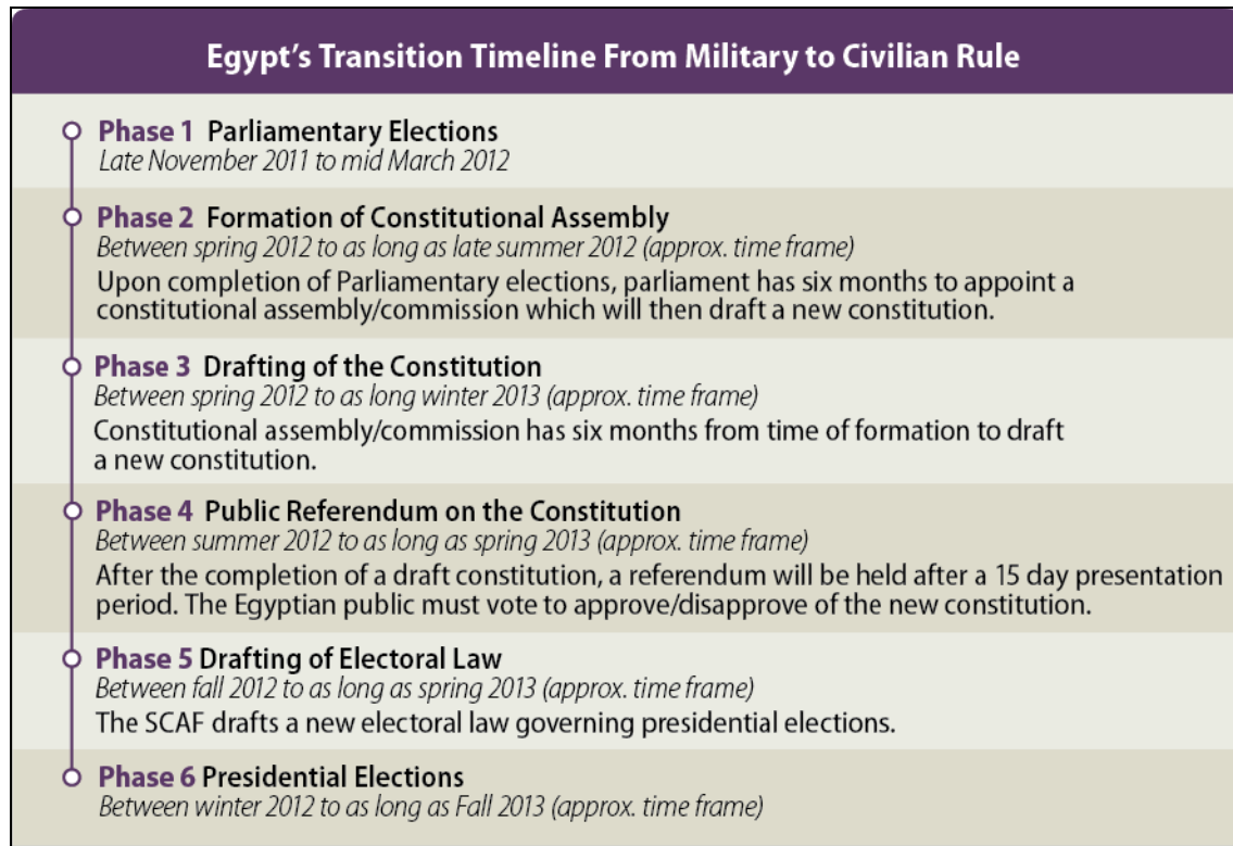
Figure 3. Egypt’s Transition Timeline

Source: Amber Hope Wilhelm, Publishing and Editorial Resources Section, Congressional Research Service. Based on the Supreme Council of the Armed Forces Constitutional Declaration and other SCAF announcements.