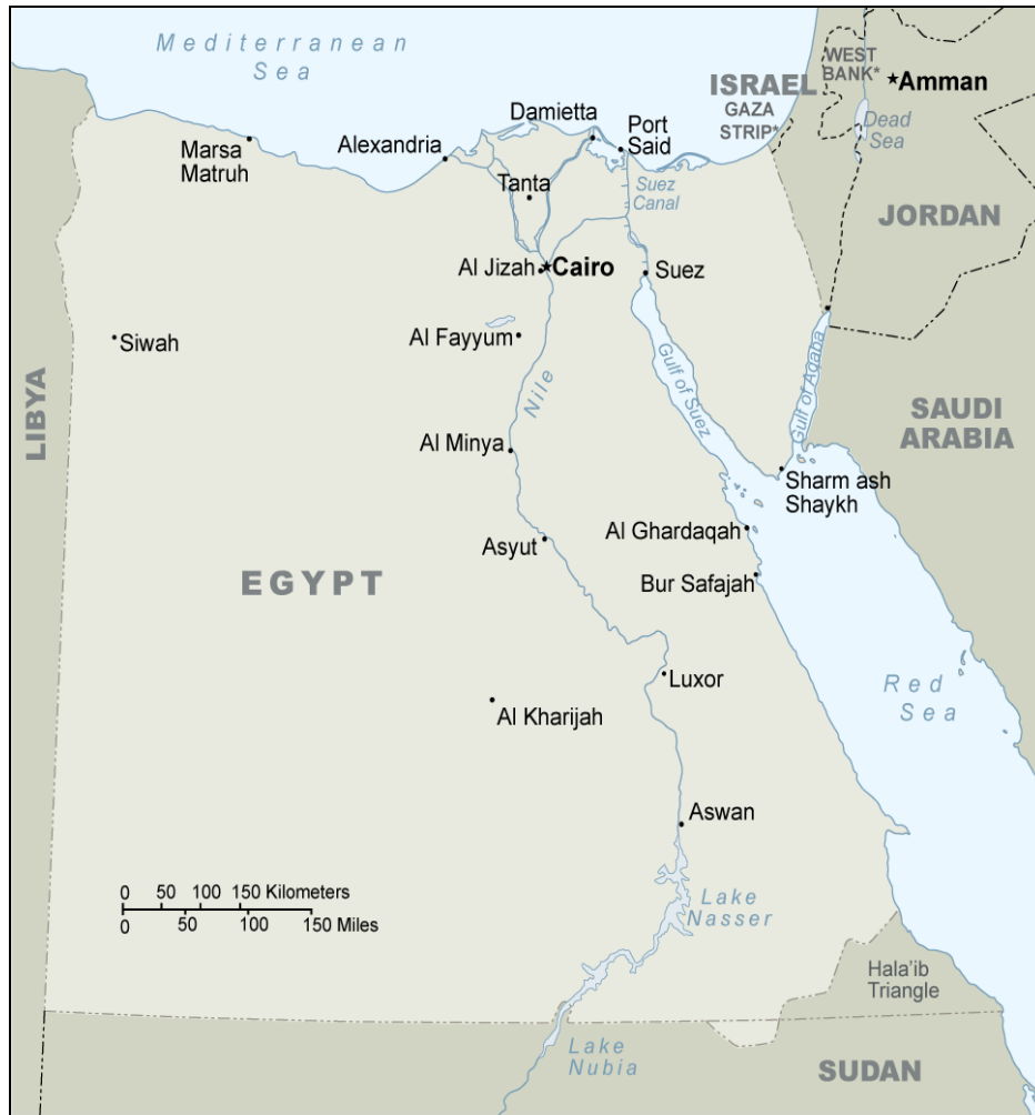
Figure 2. Map of Egypt