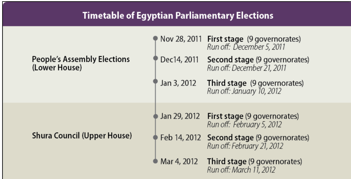
Figure 5. Timetable of Egyptian Parliamentary Elections