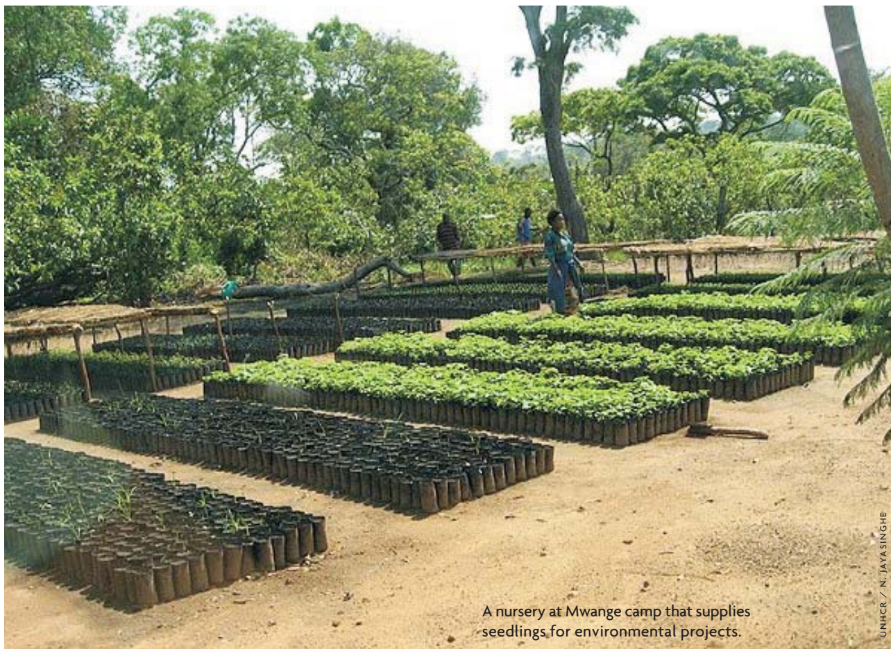
A nursery at Mwange camp that supplies seedlings for environmental projects.