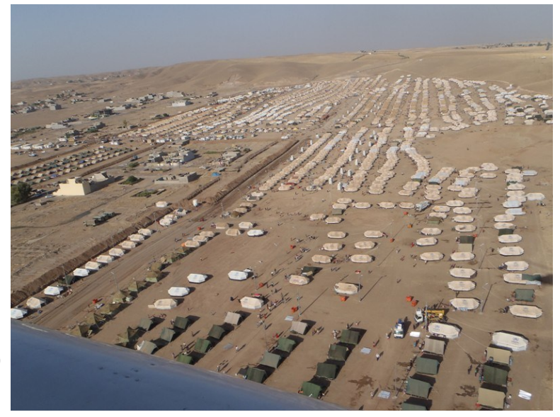
The Kawergosk camp will sppn have capacity to host 20,000 people. UNHCR

• <u>Shelter</u> - The Governor of Erbil has given approval for the Kawergosk site to be developed into a longer-term camp with a capacity of 20,000 people. This is in addition to Darashakran camp, which will also have a capacity of 20,000 and will be ready to accommodate refugees in the coming weeks. Kawergosk is currently accommodating some 15,000 people and tents have been distributed to all families.