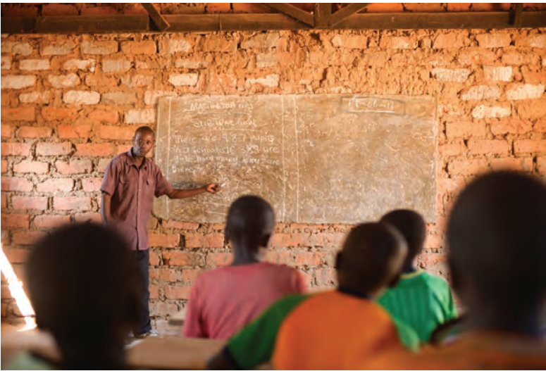
(above) Children at school in Luombwa farm block. Teachers here said they were worried that the school would shut down because of expanding commercial farming in the area, despite assurances from government officials and commercial farm operators that the school would not be shut.