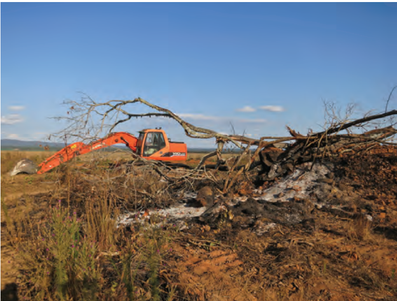
(above) Excavator used to clear land on a commercial farm in Luombwa farm block, Serenje district, after long-term rural residents were displaced.