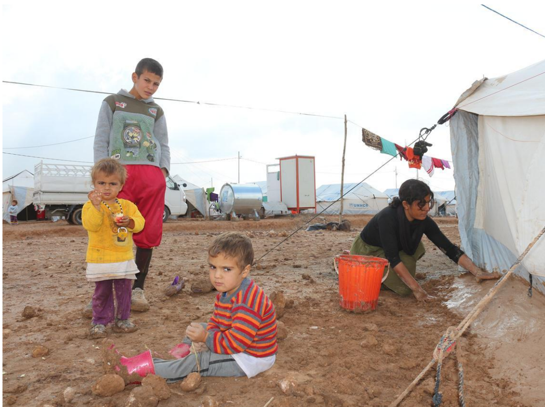
Flooding and muddy conditions have already set in in the Kurdistan Region of Iraq.