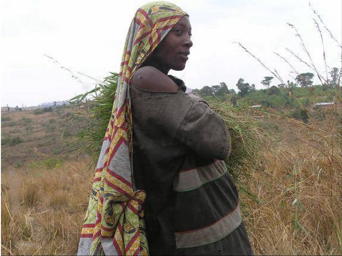
Of country and the people (2)