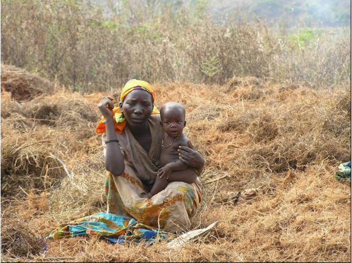
Of country and the people