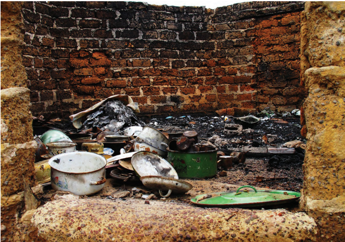
A burnt house in Zilébly village, which was attacked on March 13, 2013 by people who crossed over from Liberia. The attackers appeared to target people who were seen as associated with allegedly illegal land sales that stripped refugees of their land. April 26, 2013.

The investigation points toward a settling of scores linked to land conflict. According to local authorities, natives, complaining that their land had been sold by their neighbors while they were displaced by the crisis, have threatened these villagers with reprisals.... During the attack, the assailants burned houses of [Guéré landowners] and executed four Burkinabés. The bodies of these Burkinabés ... were mutilated. 156