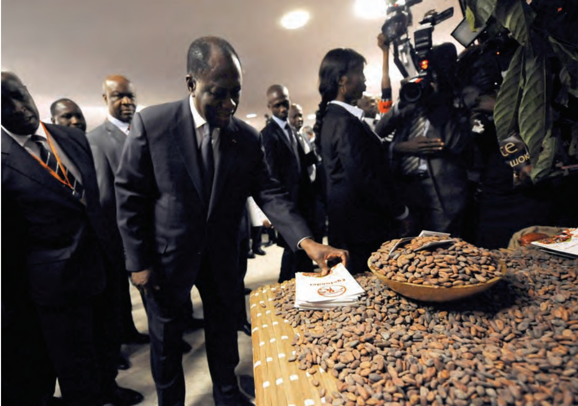
President Alassane Ouattara (center) looks at a stand of cocoa during the 2012 World Cocoa Conference in Abidjan. President Ouattara has said that resolving conflicts related to land tenure is a key priority for his government.