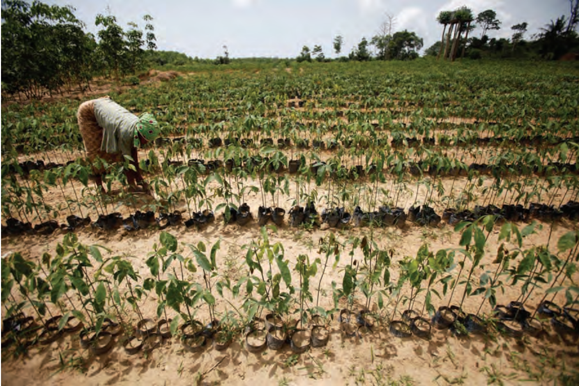
A woman works on a plantation of rubber seedlings near San Pedro. Despite their regular involvement in working the land in Côte d'Ivoire, many women face discrimination in formalizing their claims to land ownership. March 9, 2012.