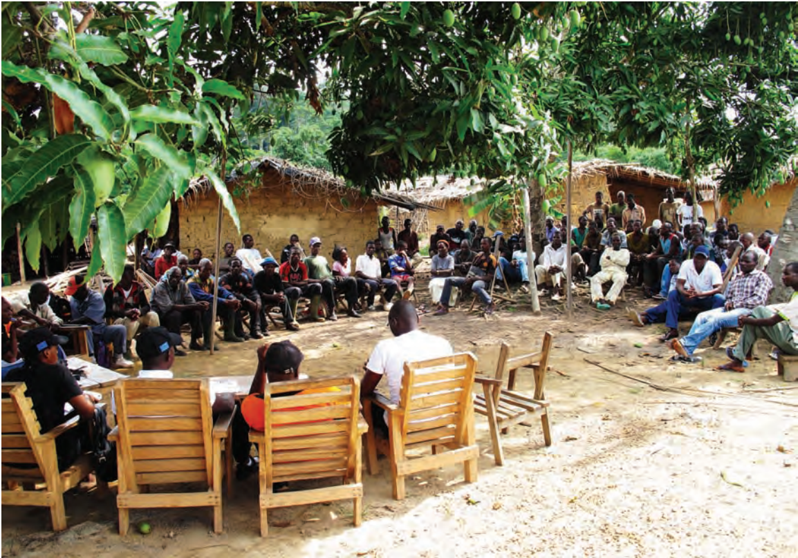
A community meeting in the village of Diouya-Dokin, organized by the Norwegian Refugee Council, to try to find solutions regarding disputed parcels of land. Village authorities play a crucial role in resolving land conflicts in western Côte d'Ivoire. April 25, 2013.

Finally, some village chiefs in western Côte d'Ivoire are part of the problem: Tied up in politics or even involved in illegal land sales themselves, they are unable to play the role of a neutral arbiter. There also do not appear to be clear procedures—for example, in how the village land committees take and consider evidence before making their decision—which increases the potential for unjust results when customary authorities are not neutral.