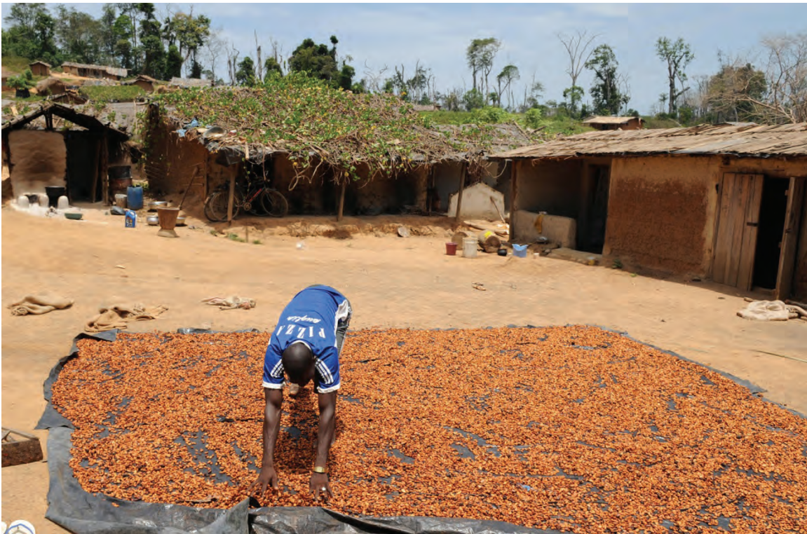
A cocoa farmer spreads cocoa beans that will dry under the sun in the village of Cantondougou, 360 kilometers west of Abidjan, April 23, 2009.

During the 1990 and 1995 elections, politicians' speeches encouraged indigenous people from the forest regions to believe that the rise to power of the opposition leader Gbagbo would lead to the expropriation of land from non-native and non-indigenous peoples and its subsequent reallocation. By taking up the 'land for indigenous people' slogan incorporated in the Land Act on the eve of the 2000 presidential, legislative and municipal elections, politicians aimed to attract voters while reinforcing the principle of reclaiming land... 29