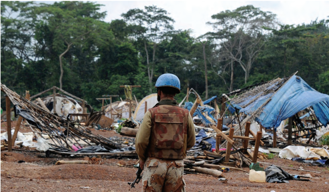
A UN peacekeeper stands near the destroyed Nahibly displaced persons camp near Duékoué, July 22, 2012. On July 20, members of the Ivorian military and allied forces burned down the camp, which then housed around 4,500 people, and summarily executed or disappeared some people who fled.

soldiers and allied forces burned to the ground the Nahibly IDP camp in July 2012, which housed around 4,500 people still displaced after the crisis. 61 The International Federation for Human Rights (FIDH) has reported verifying at least six summary executions by FRCI soldiers and the “disappearance of dozens of displaced persons.” 62 FIDH said that there may be up to 13 mass graves linked to the Nahibly attack, including a well in which six bodies were found in October 2012. 63