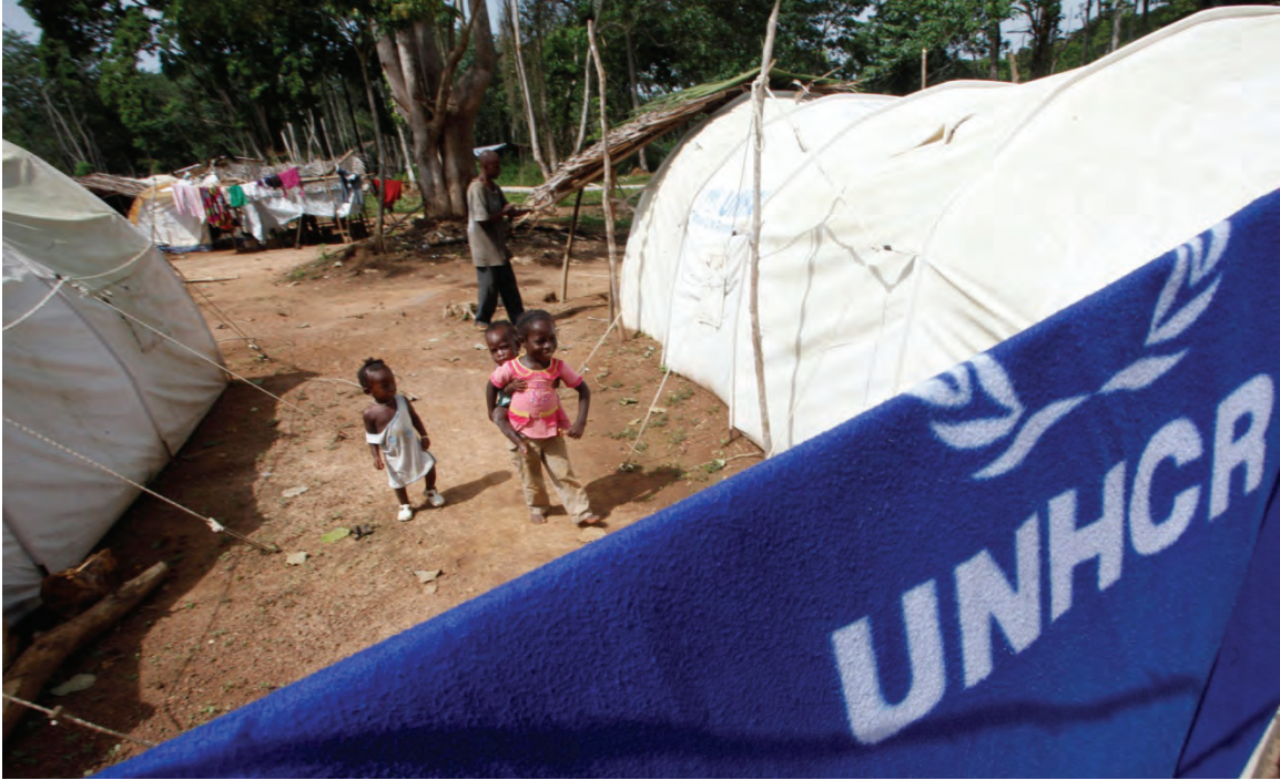
Children walk in an Ivorian refugee camp, commonly known as PTP camp, in Grand Gedeh County, eastern Liberia, on May 22, 2012. More than 58,000 Ivorian refugees remain in Liberia as of August 2013, including more than 11,000 at PTP camp.

Most of the several dozen Ivorian refugees interviewed in Liberia in December 2012 cited land dispossession as among the main reasons why they feel unable to return to Côte d'Ivoire. Other reasons included what they perceived to be a lack of security for pro-Gbagbo supporters and, relatedly, the lack of progress on disarmament. A Liberian refugee official in Zwedru similarly told Human Rights Watch that refugees cited two main reasons for not returning to Côte d'Ivoire: first, security; and second, because of the alleged occupation of their land. 168