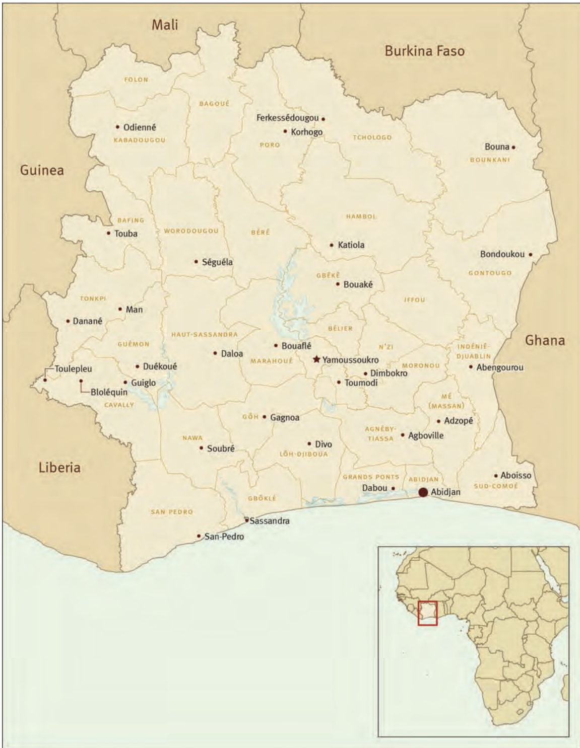
Côte d'Ivoire.