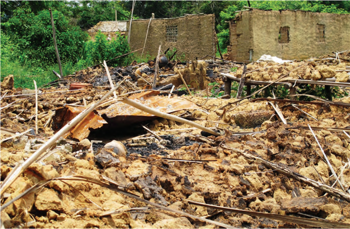
Houses destroyed in the village of Petit-Guiglo, which came under attack on March 23, 2013. As in Zilébly, the attack appeared to be motivated at least in part by land dispossession linked to the post-election crisis. April 26, 2013.

In addition to the cross-border attacks from Liberia, Human Rights Watch documented several inter-communal clashes in western Côte d'Ivoire related to land disputes involving formerly displaced persons. In early February 2013, Guéré residents from the neighboring villages of Zomplou and Babli-Vaya skirmished, resulting in several minor injuries and at least one serious injury, when a youth from Babli-Vaya struck a youth from Zomplou with a piece of wood. 163 Residents of Zomplou allege that youth from Babli-Vaya illegally sold hundreds of hectares of their virgin forest while they were displaced by the crisis. A Zomplou resident who was among those demanding restitution said that more clashes were likely if local authorities do not quickly resolve the dispute: