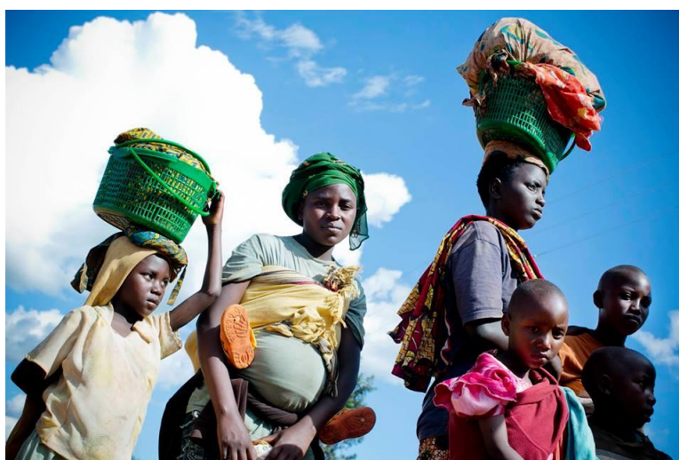
Burundians arrive in Bugesera transit centre in eastern Rwanda.