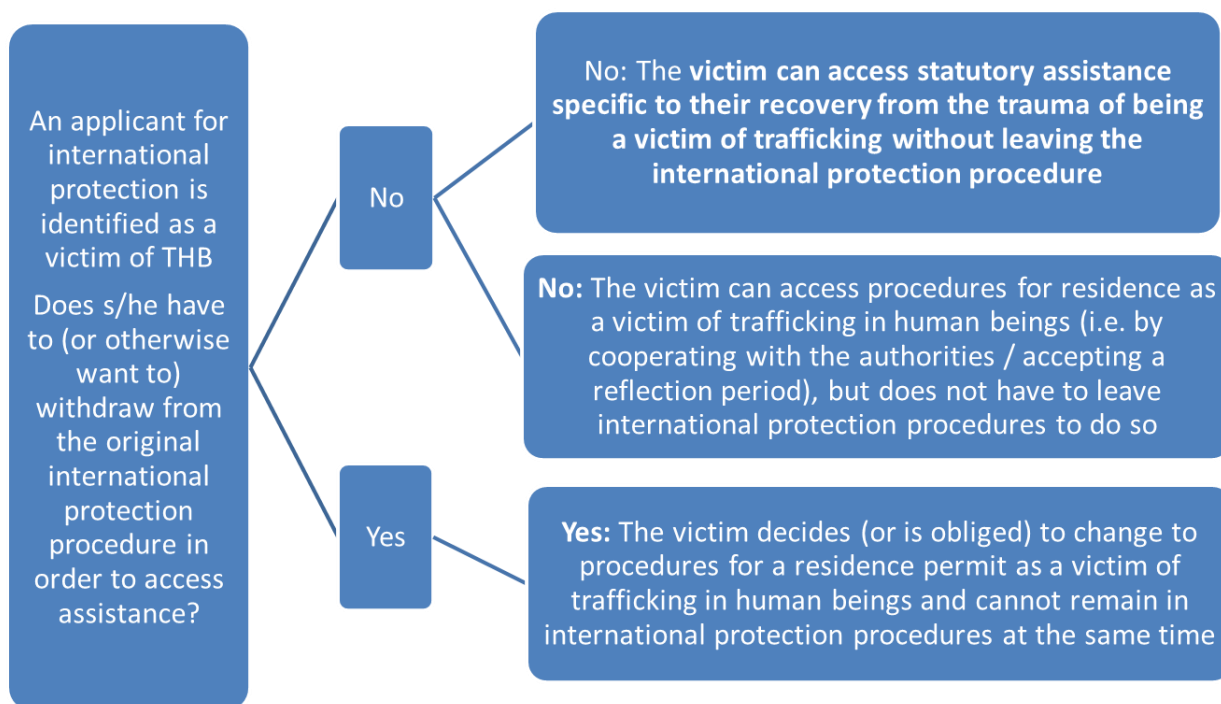
Figure 8.1: flow chart illustrating the possibilities for referral to assistance for victims in international protection procedures