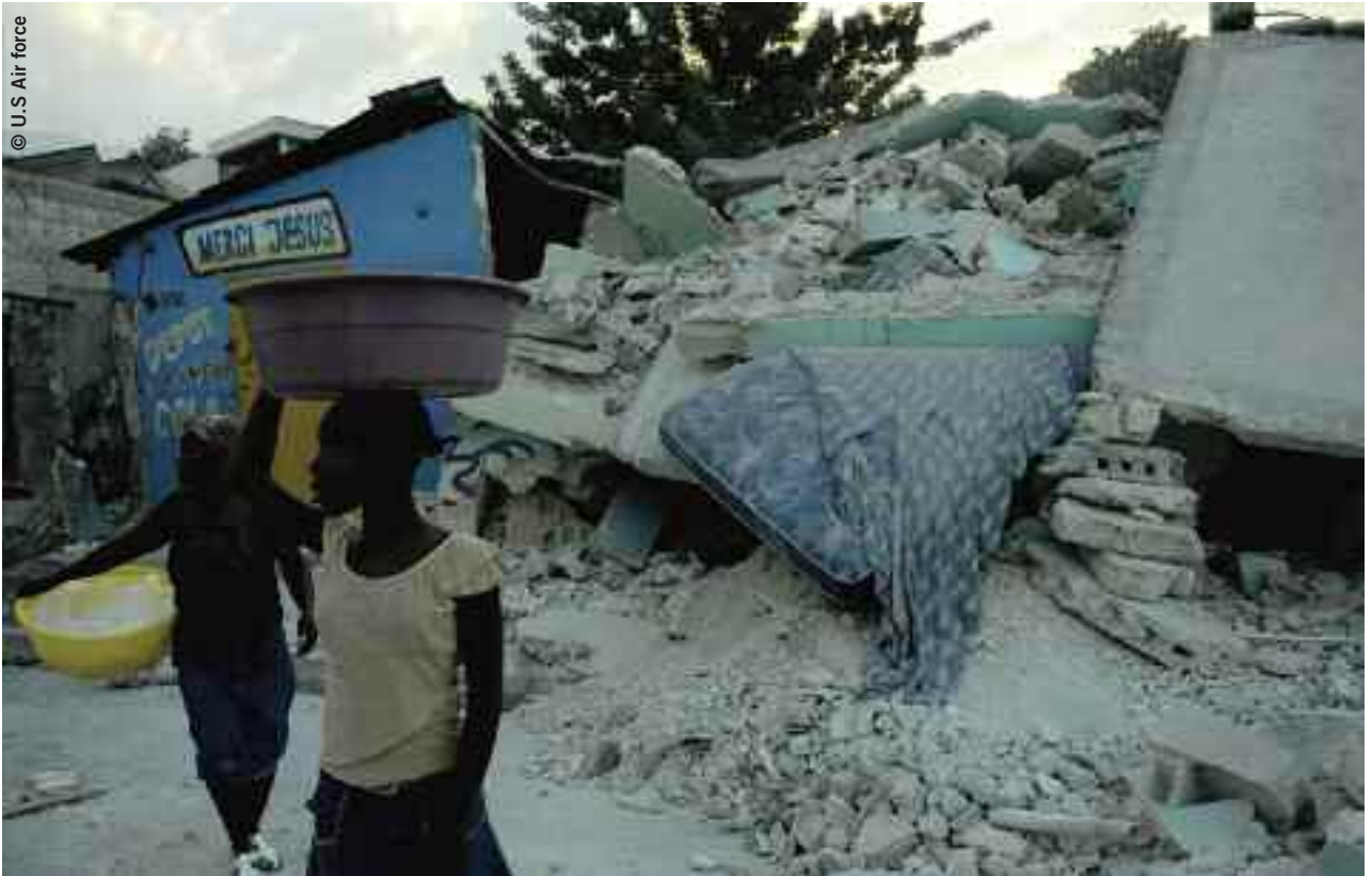
19 January 2010. Days after the earthquake, women walk amid the devastation in Port-au-Prince. CC BY-NC 2.0