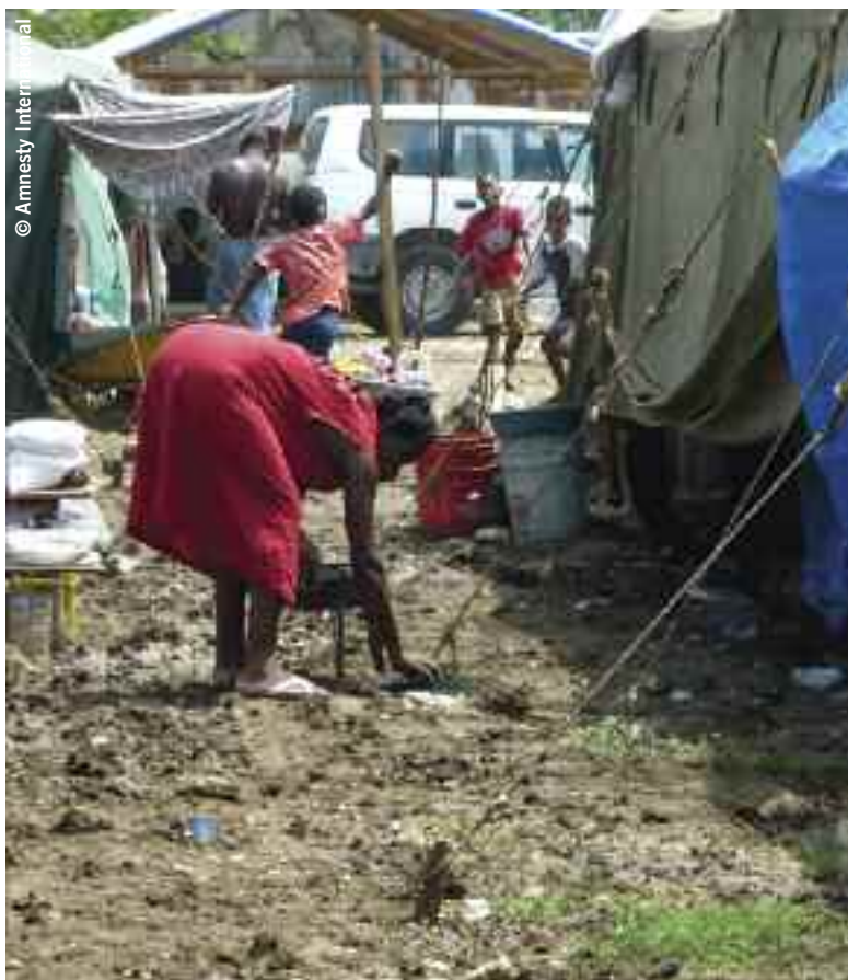
Far left: Camp Cozbami, Cité Soleil, July 2010.

Large families are crammed into tents or under tarpaulins with very little space per person. CC BY-NC-SA 2.0