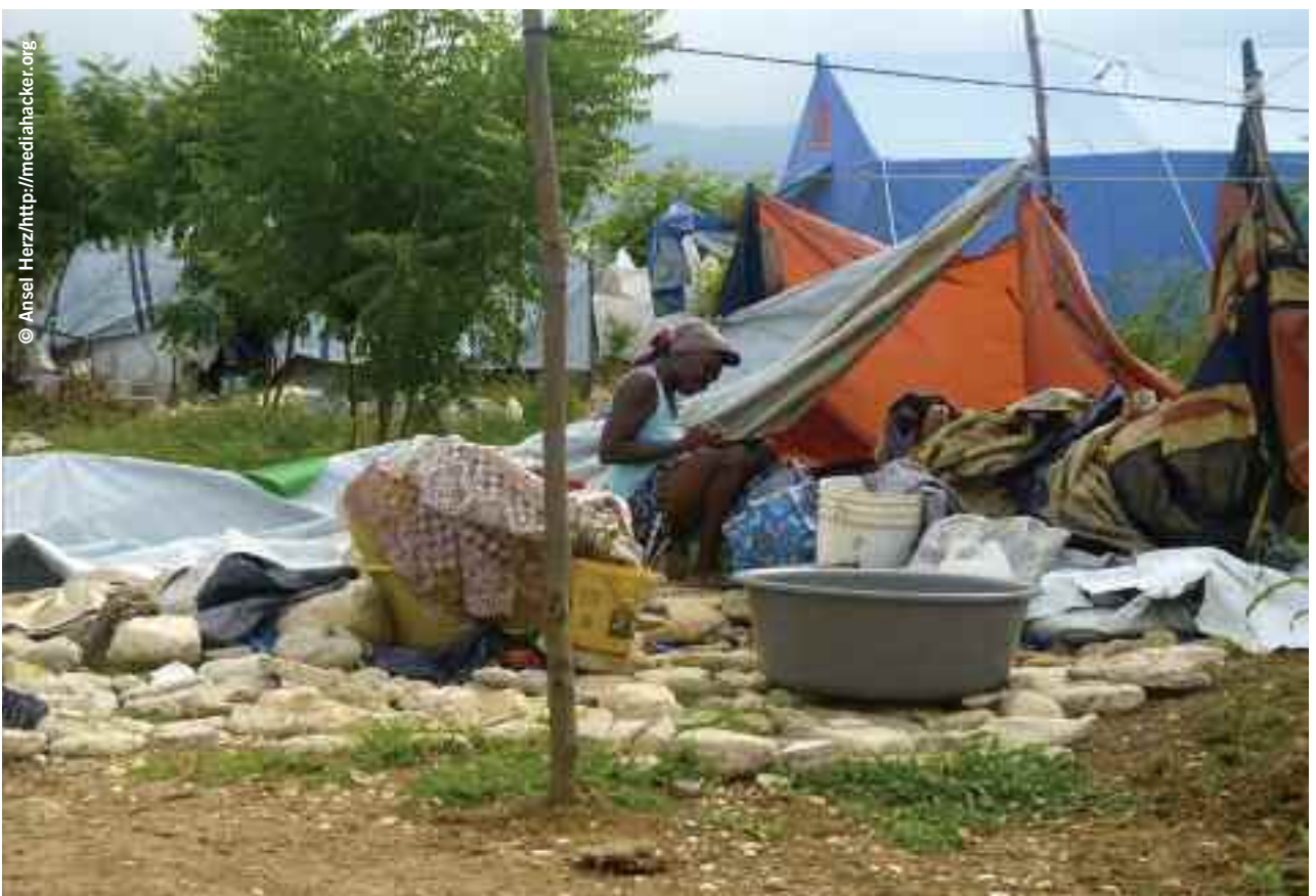
November 2010, Camp Carradeux, where tents destroyed by storms have not been replaced. Nearly a year after the earthquake, more than 1.3 million people are still displaced. CC BY-NC-SA 2.0