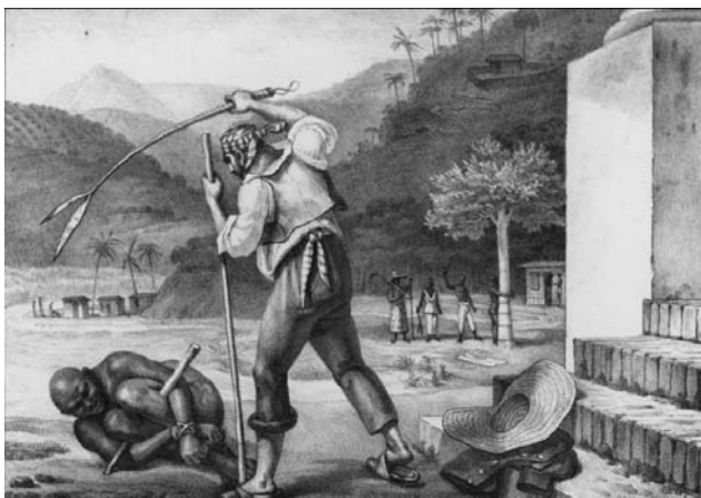
Representation of the torture method known as the 'jack', based on a lithograph reproducing a drawing from Jean Baptiste Debret, "Feitours corrigeant des nègres", in Voyage Pittoresque et historique au Brésil , Tome II, plate 25, page 82, c. 1835. Public domain.

Furthermore, Amnesty International has received credible information from various independent sources that Chefs de Section and local police chiefs ran small detention centres, sometimes even in their own homes, where ill-treatment allegedly took place. Methods of torture described in testimonies received by Amnesty International include beatings on the head or other parts of the body with sticks, forcing detainees to remain standing still for very long periods, and detainees being tied in the position known as the "pau de arara", parrot's perch, or the "jack". 14