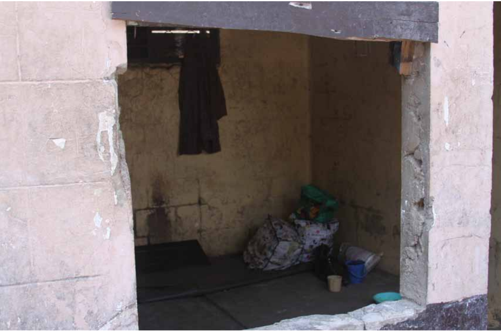
(above) One of the dormitories in the Special Ward at Accra Psychiatric Hospital, where the courts referred people with mental disabilities who had committed crimes.