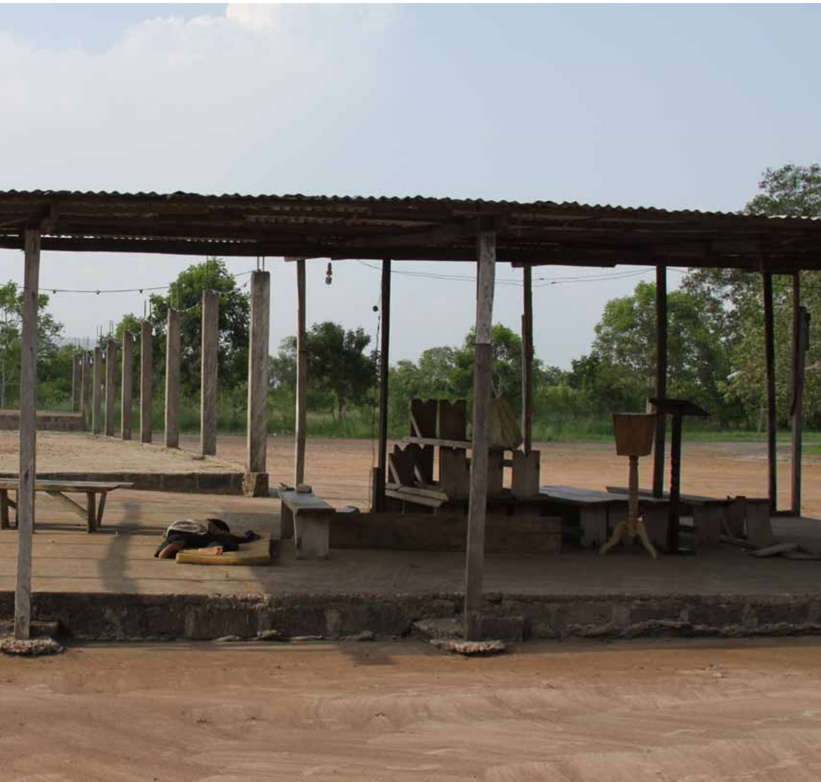
This man's family brought him to United Bethel Pentecostal Ministry International Prayer Camp, Kordiabe, Eastern Region, for healing because of presumed mental disability. He lives under this shade day and night, separated from the rest of the people receiving healing at the camp.