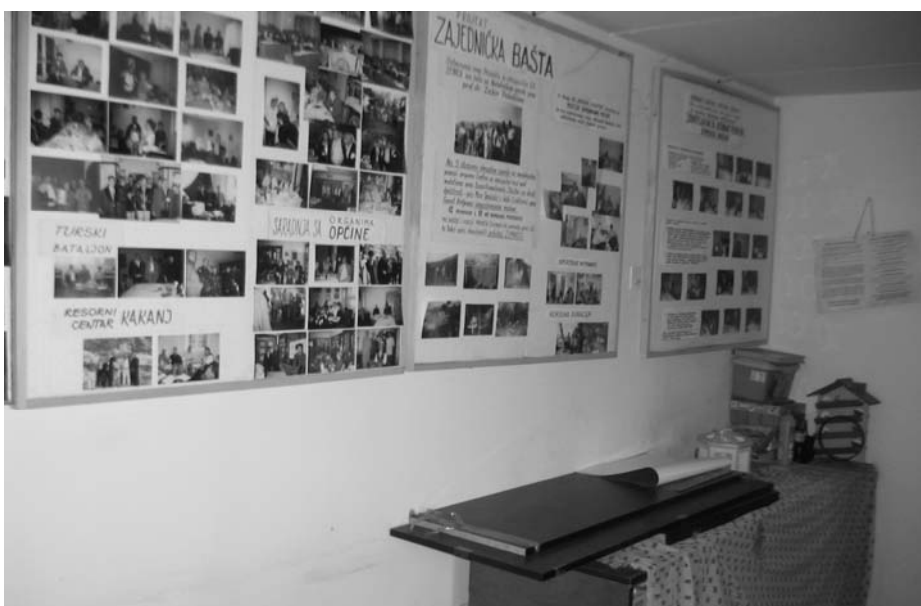
The office of the association Romano Centro, in Zenica (BiH), where activities for Romani children are organized.

communities are even less likely to find employment because of discrimination as well as lack of educational qualifications. Estimates based on the number of Roma receiving social assistance suggest that approximately 70 per cent of Roma in BiH are unemployed. 62 Other sources report that as few as 2 per cent of Roma are employed. 63 Romani women face particular difficulties in the BiH labour market. In a recent poll of 197 Romani women, only 10 were employed and of those only three had a permanent job. 64