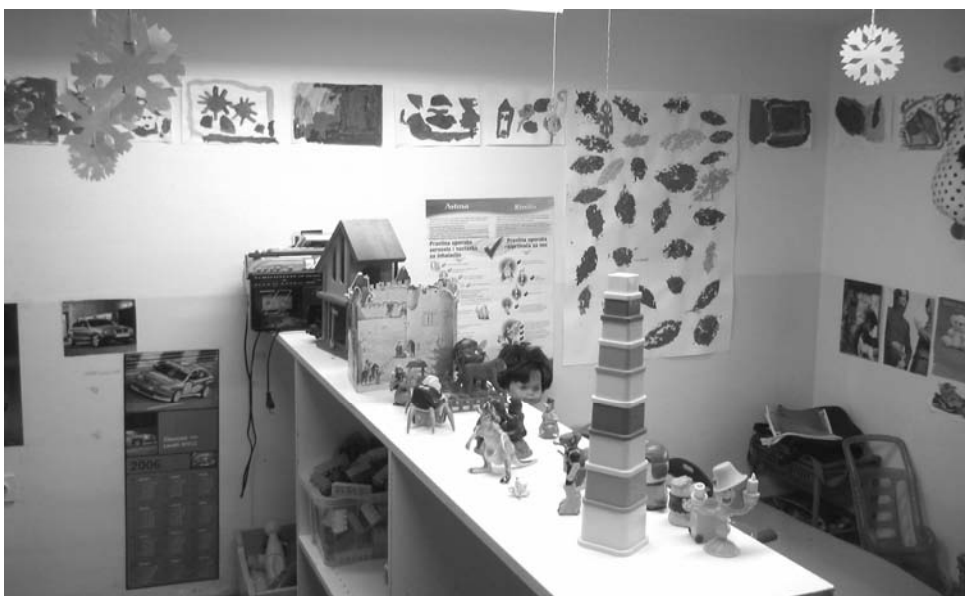
A pre-school in Čakovec, Croatia, attended by Romani children.

A Romani child from the Međimurje region, Croatia, talking about her experience in school.