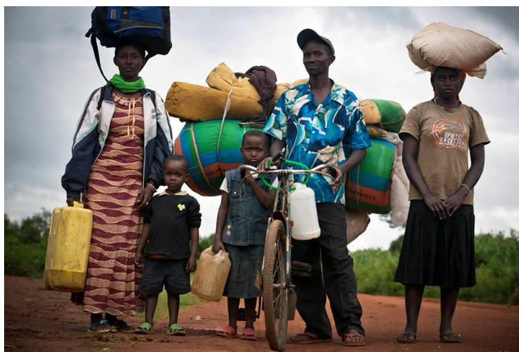
New arrivals in Bugesera reception centre, eastern Rwanda.