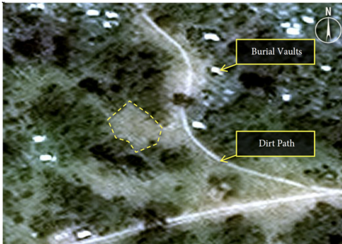
Satellite image shows undisturbed earth in early November 2015.

Video analysis identifies five separate graves within a larger area of disturbed earth. Judging by satellite imagery dating from 22 December 2015, the approximate size of the whole area is 49 m 2 . The analysis corroborates testimony describing five graves.