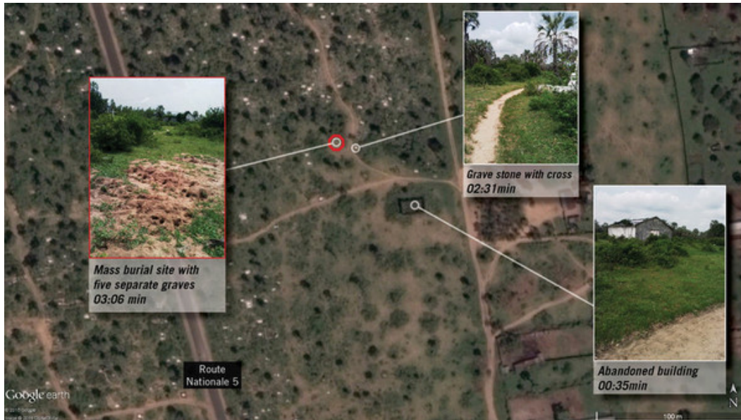
This graphic is based on a satellite imagery pre-event, from 3 November 2015, and is used to show location only. Photographs are screenshots from a video taken after the graves were dug (c) DigitalGlobe. Google Earth. Produced by Amnesty International.

Video analysis identifies five separate graves within a larger area of disturbed earth. Judging by satellite imagery dating from 22 December 2015, the approximate size of the whole area is 49 m 2 . The analysis corroborates testimony describing five graves.